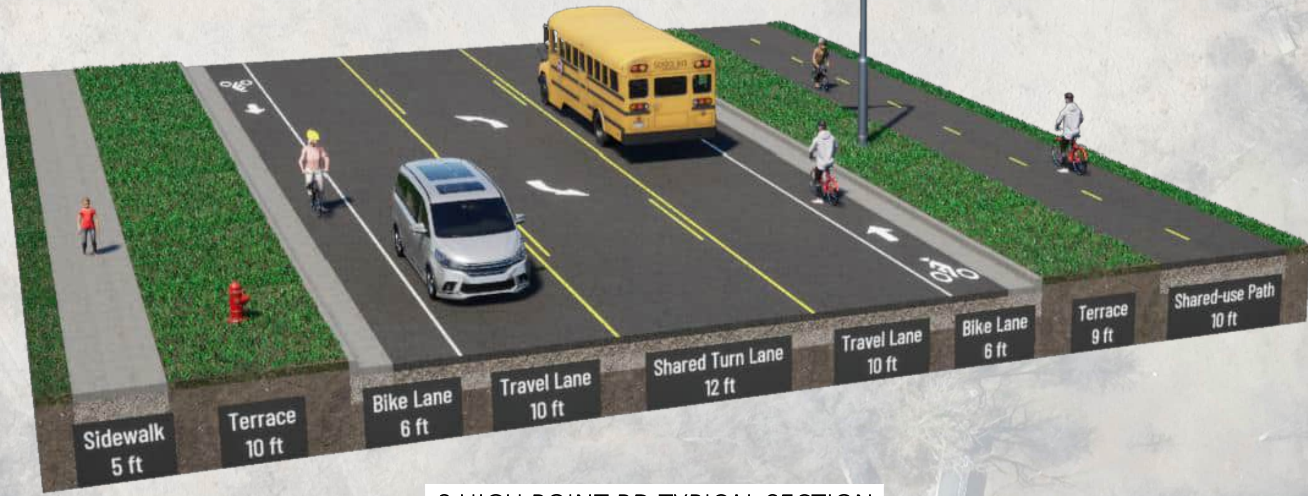
S HIGH POINT RD TYPICAL SECTION TWO-WAY LEFT-TURN LANE