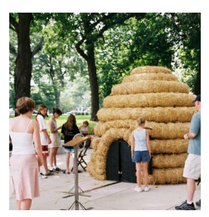
"The Beehive Project" by Chele Isaac, was an interactive public art project consisting of a large scale beehive, featuring a queen bee inside typing a story on an old typewriter. The public participated by helping to write the story.