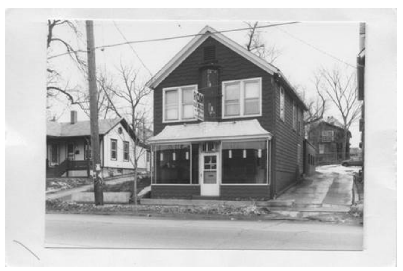
2_{\frac{\text{HISTORIC PHOTO}}{\text{NOT TO SCALE}}}