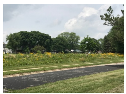
Portland Park – prairie at time of planting and one year later