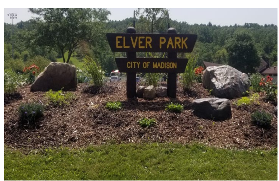
Elver Park – Signature bed beautification – before and after