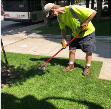
Concourse and State Street planter – summer annuals