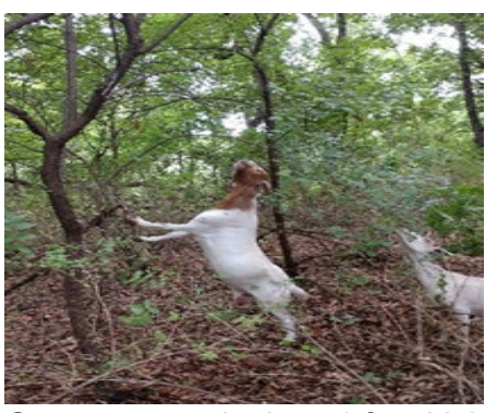
Goats can reach about 6 feet high.