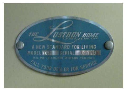
Manufacturer's Serial Number