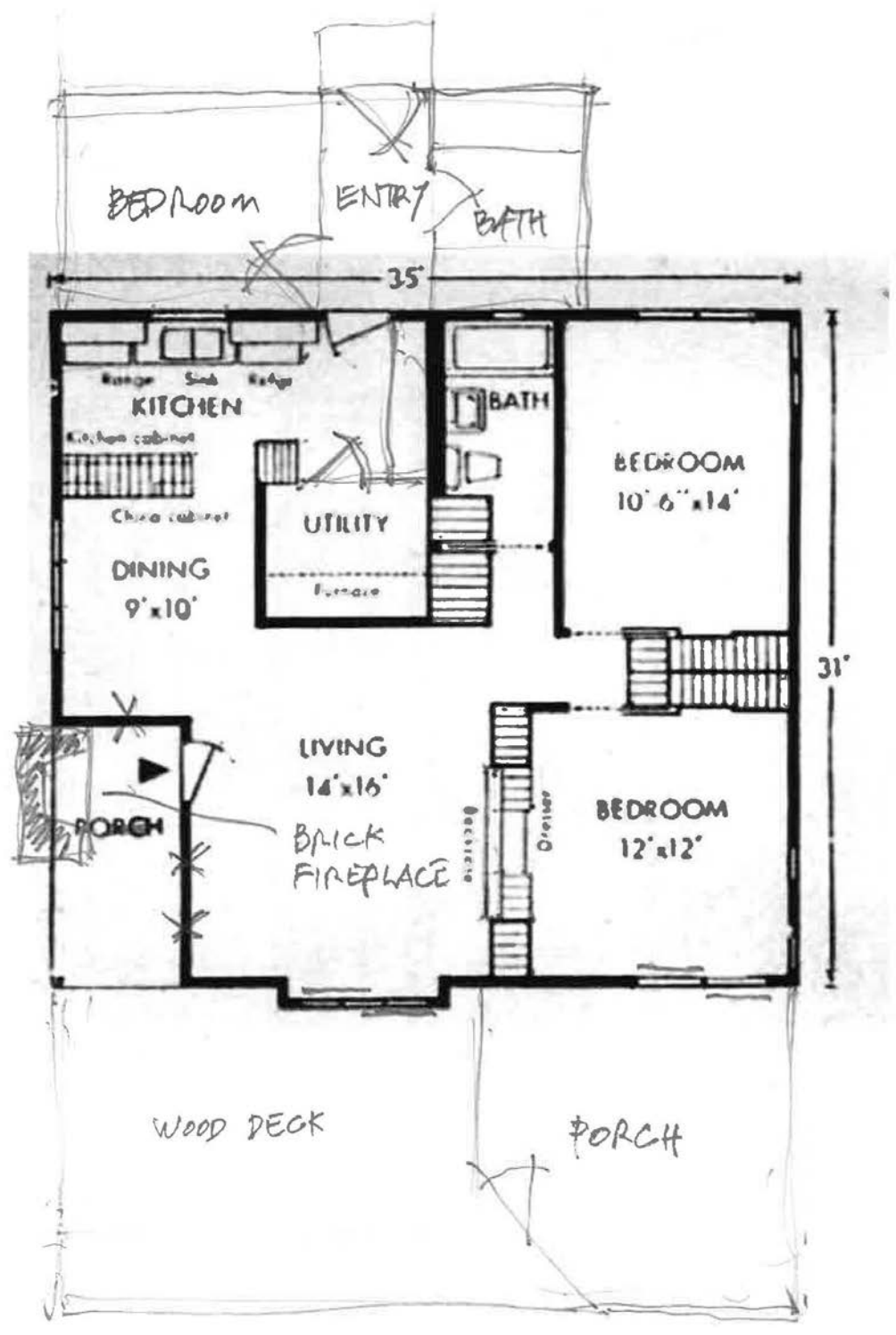
Floor Plan as Altered