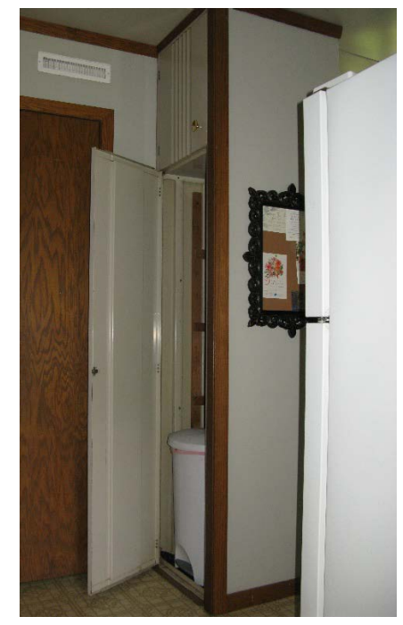
Kitchen – original cabinet