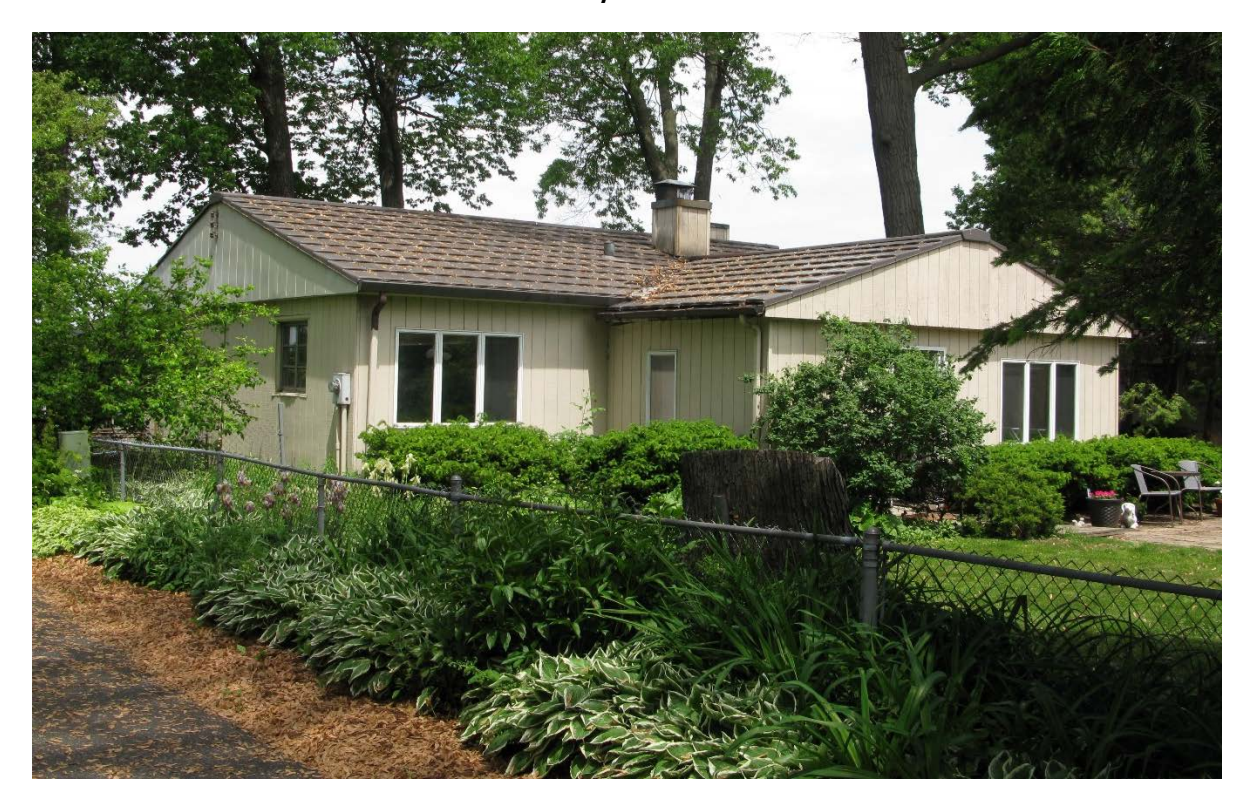
REAR ELEVATION - Current View at From Street