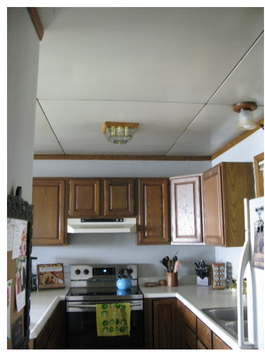
Kitchen – original ceiling