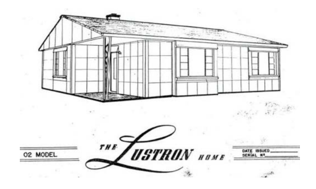
FRONT ELEVATION - From Factory Brochure