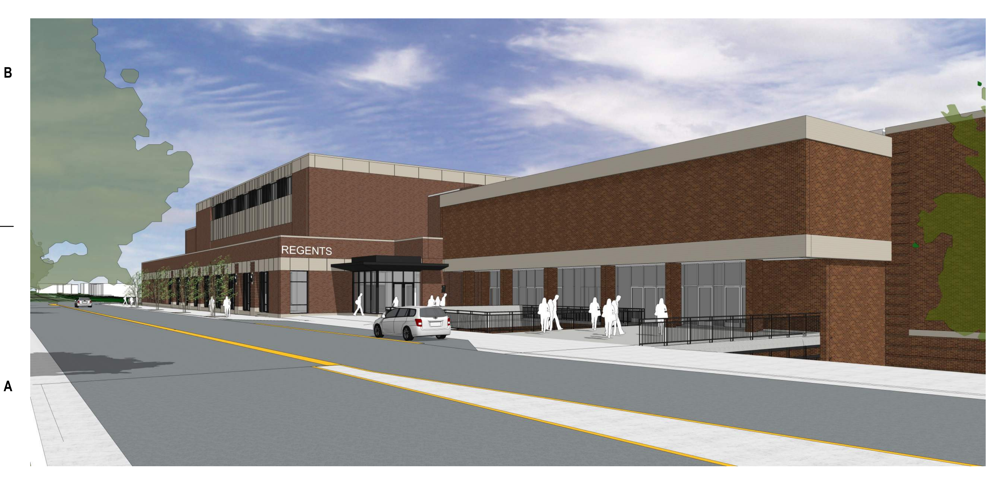
VIEW OF ATHLETIC ADDITION ENTRY FROM REGENT STREET - FUNDRAISING