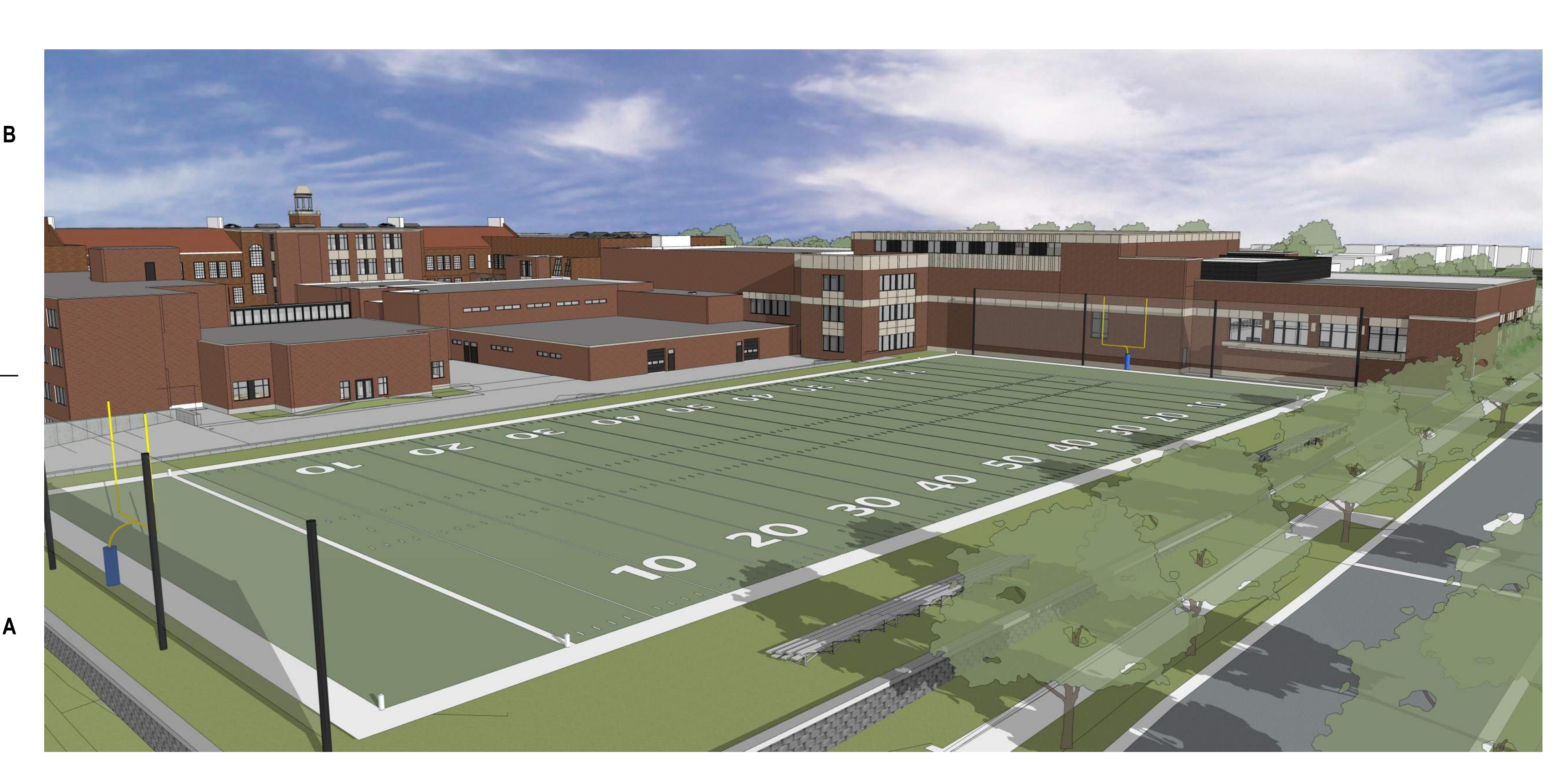
AERIAL VIEW AT VAN HISE AND HIGHLAND - FUNDRAISING