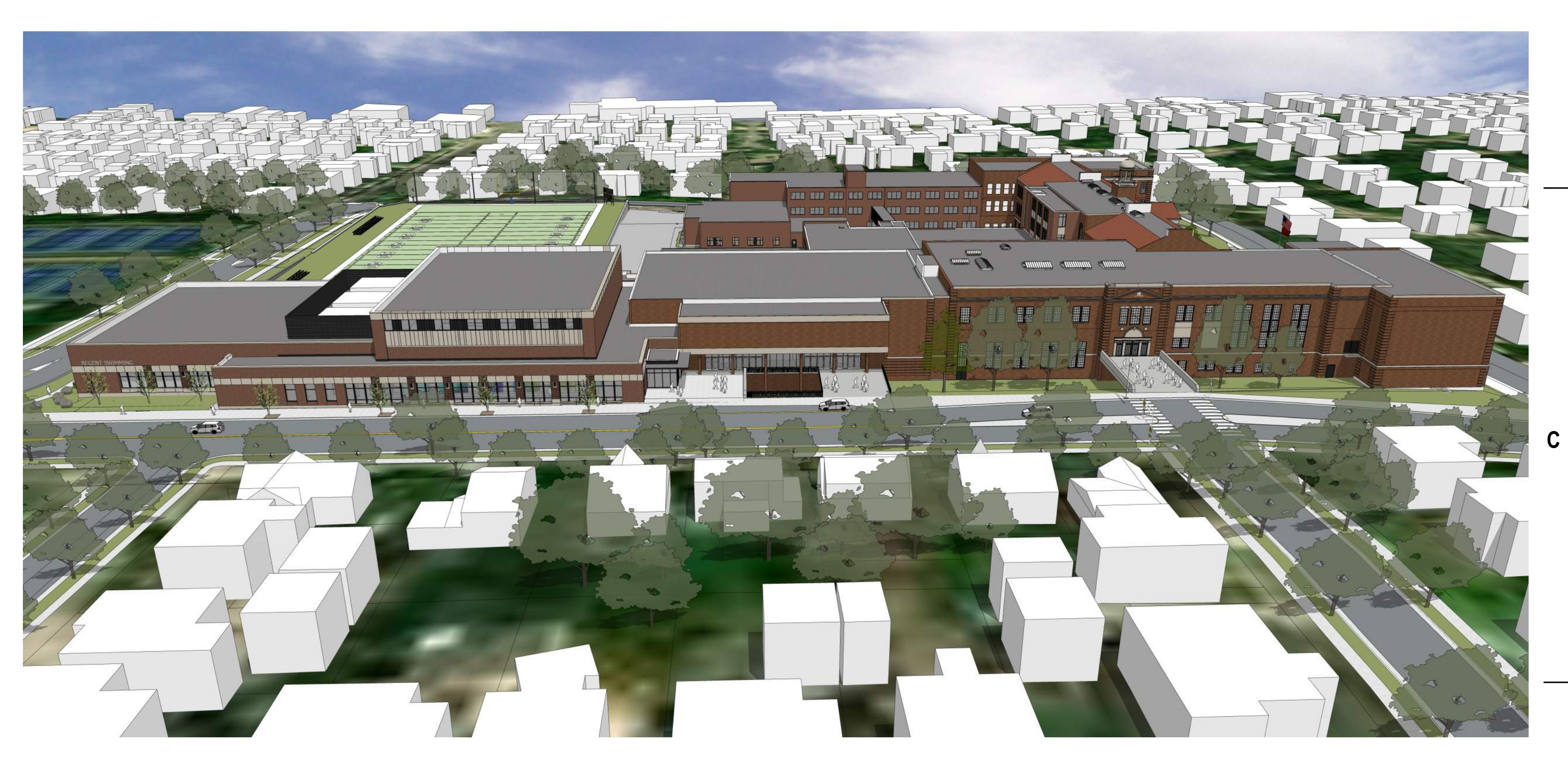
AERIAL VIEW OF ATHLETIC ADDITION - BASE