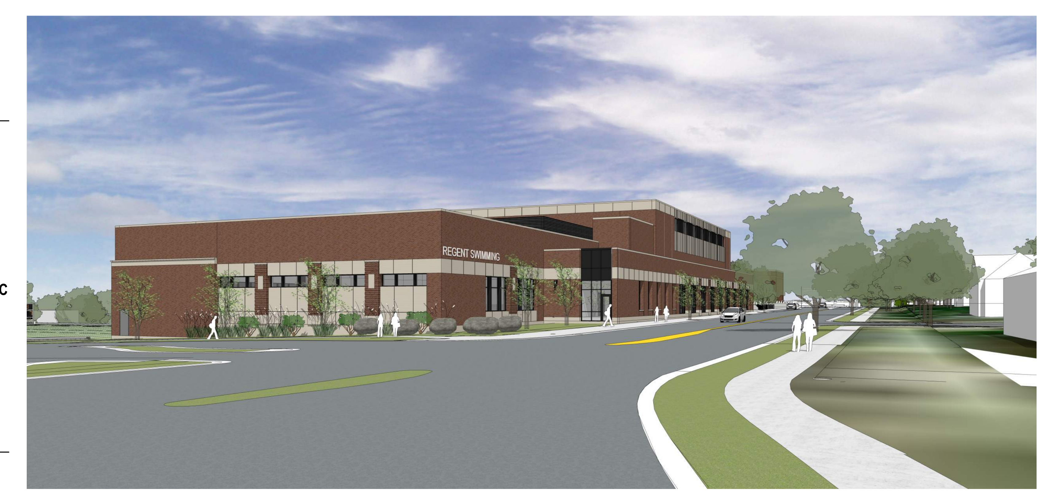
SPEEDWAY VIEW LOOKING EAST - FUNDRAISING