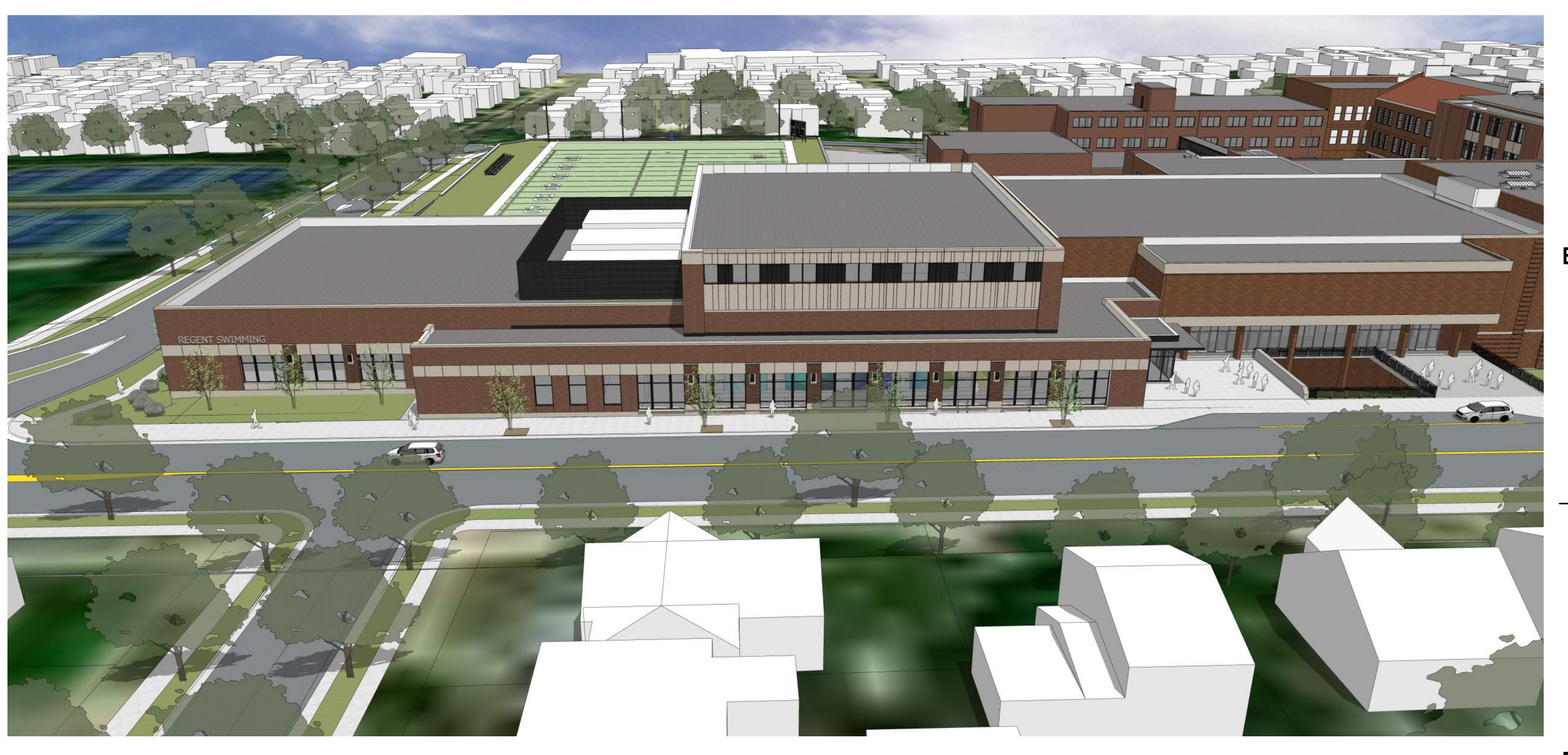
AERIAL VIEW OF ATHLETIC ADDITION - BASE