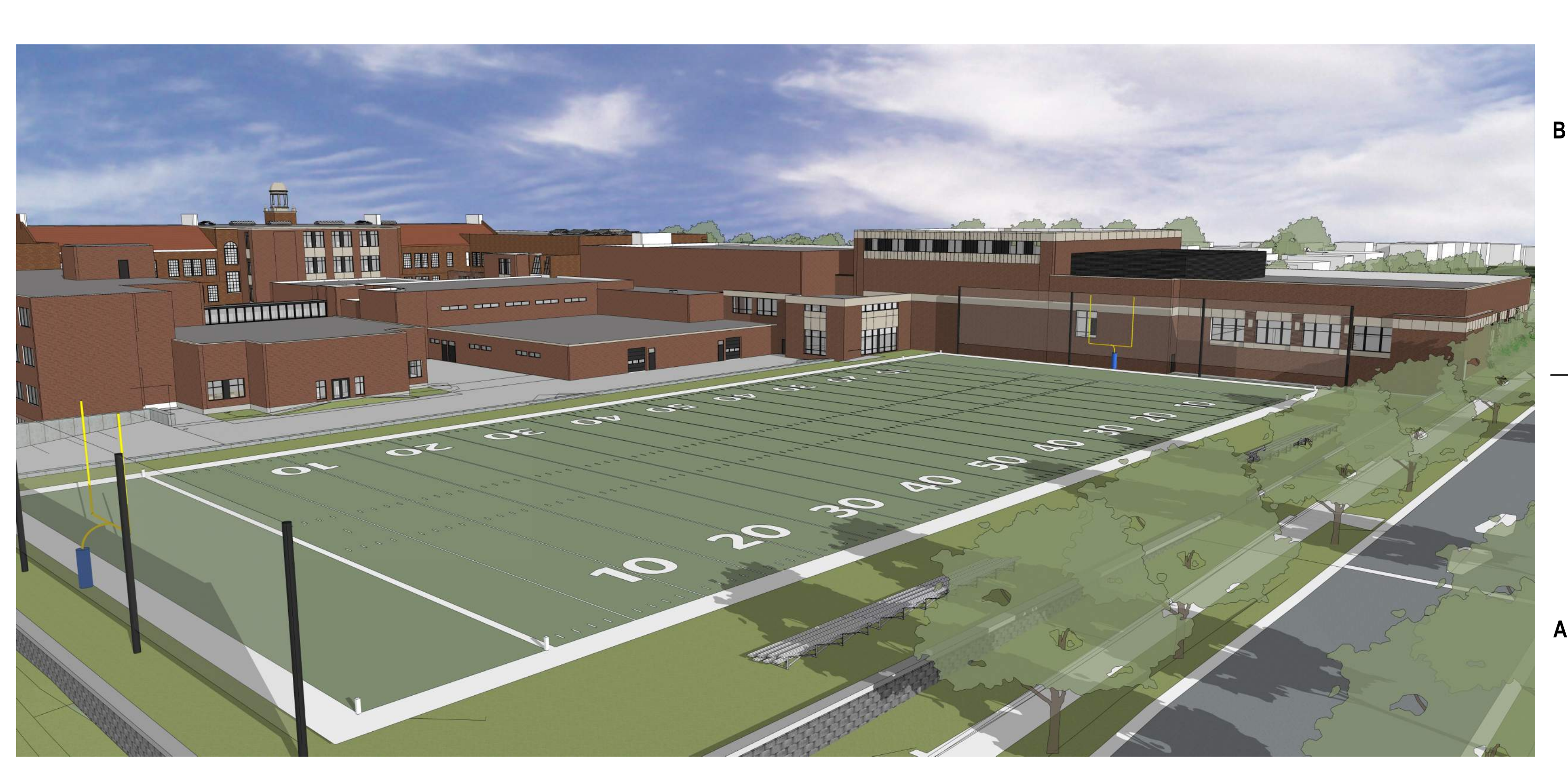
AERIAL VIEW AT VAN HISE AND HIGHLAND - BASE