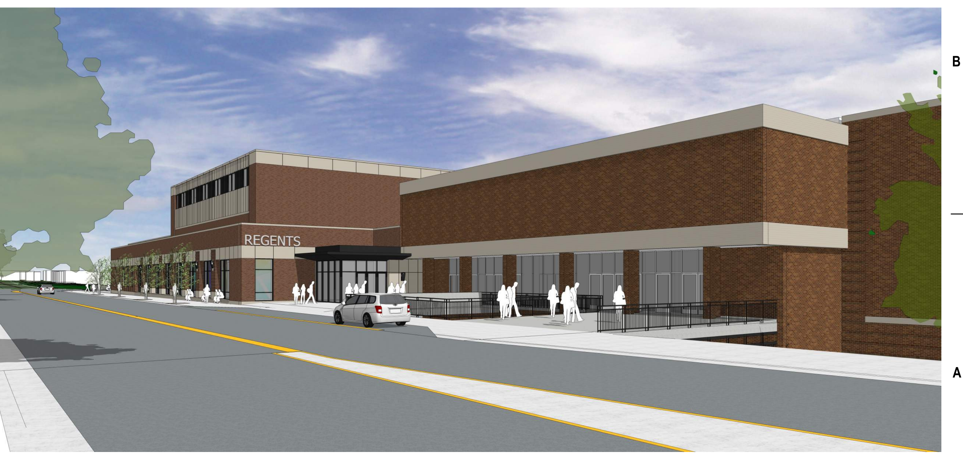
VIEW OF ATHLETIC ADDITION ENTRY FROM REGENT STREET - BASE