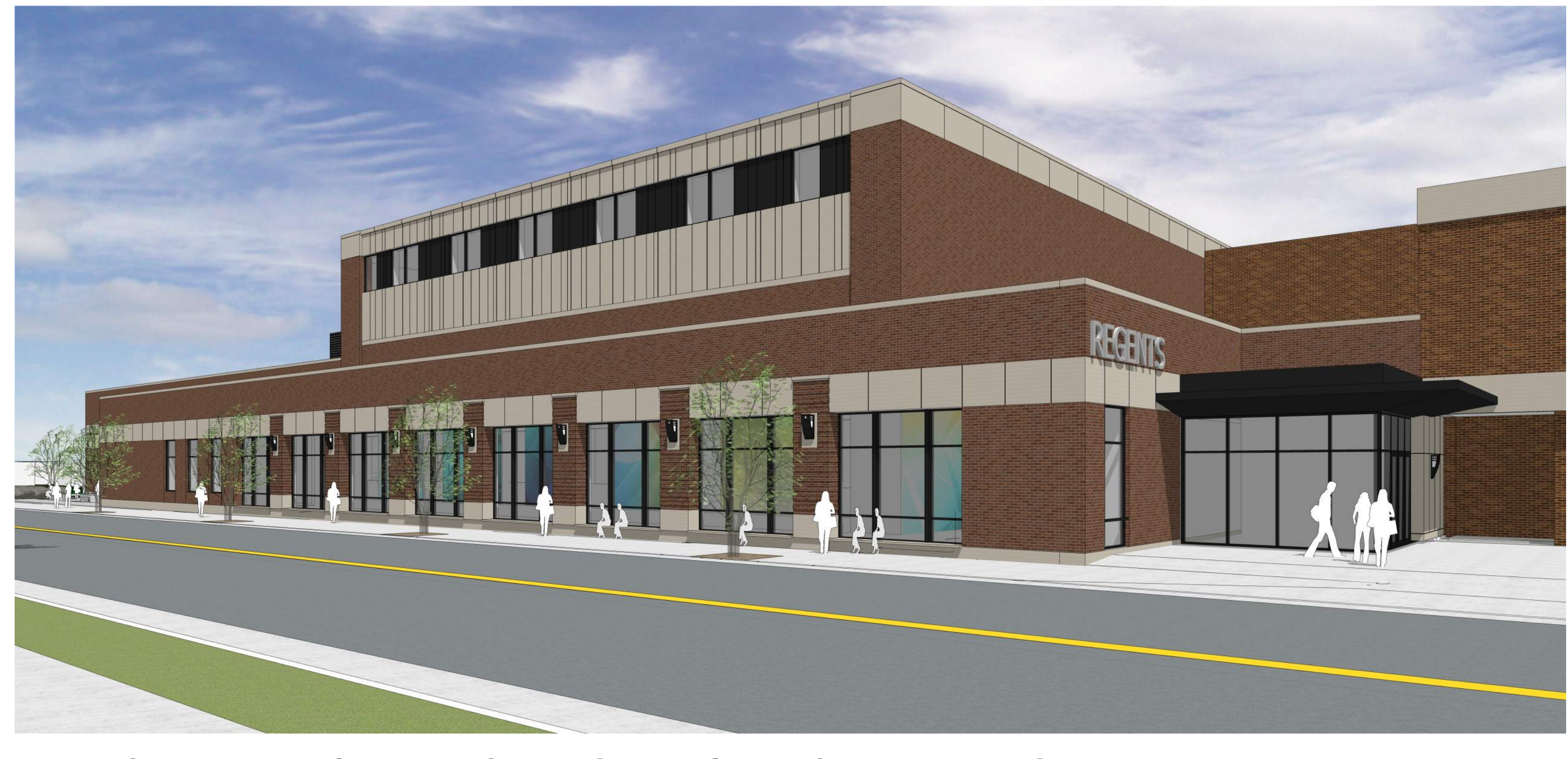
VIEW OF ATHLETIC ADDITION FROM REGENT STREET - BASE