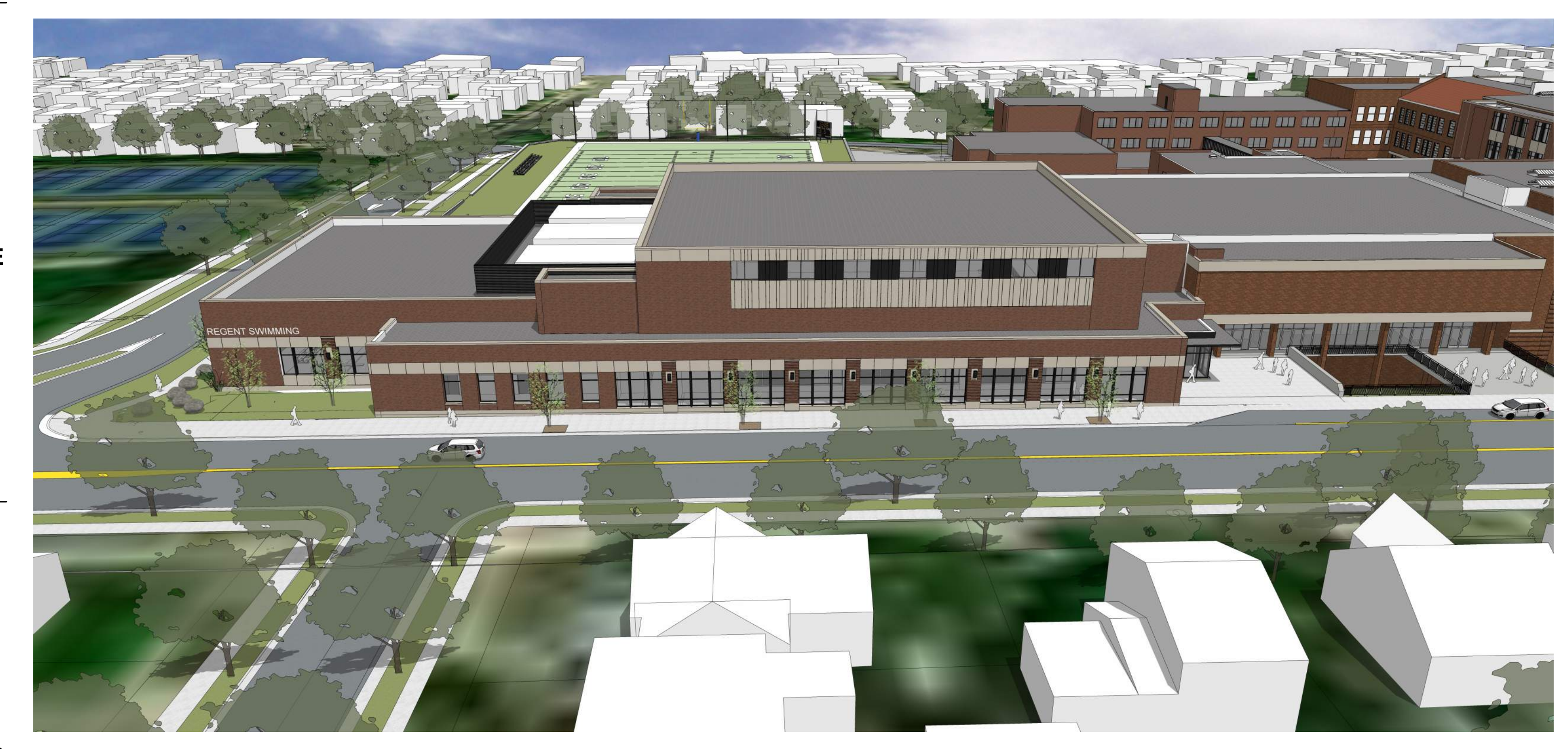
D AERIAL VIEW OF ATHLETIC ADDITION - FUNDRAISING