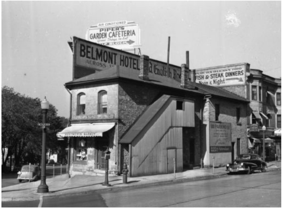
Hartmeyer Meat Market, 15 October 1974, WHS 48724

Legistar File ID #66291 101 N Hamilton Street July 26, 2021 Page 4 of 6