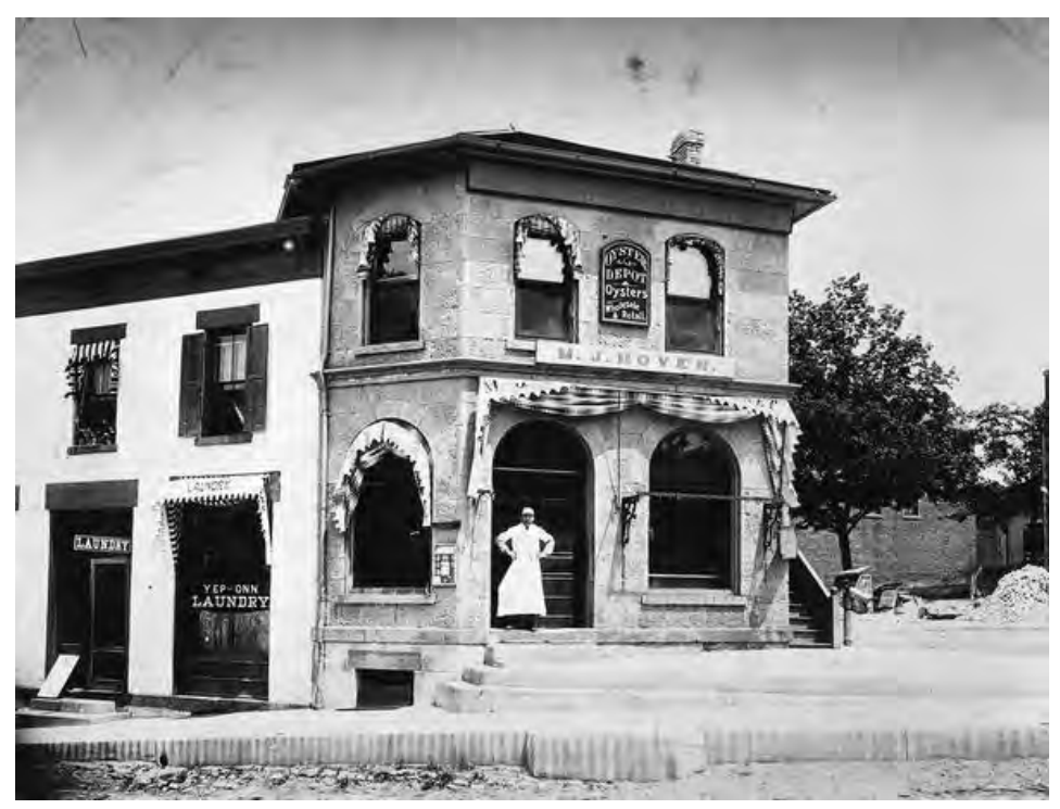
M.J. Hoven Meat Market, ca. 1899, WHS 11037

building functioned as the side and not a street façade, whereas the E Mifflin frontage for 110 E Mifflin operated as a storefront.