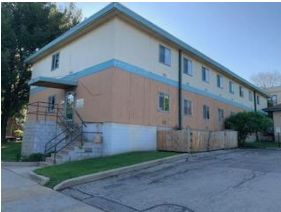
City Assessor’s Office

Commercial building constructed in 1958 and remodeled in 1989.