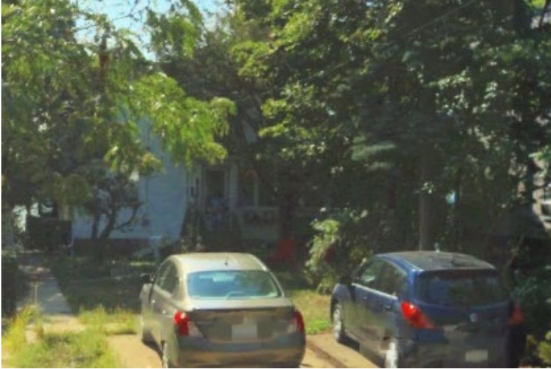
Bing Street View