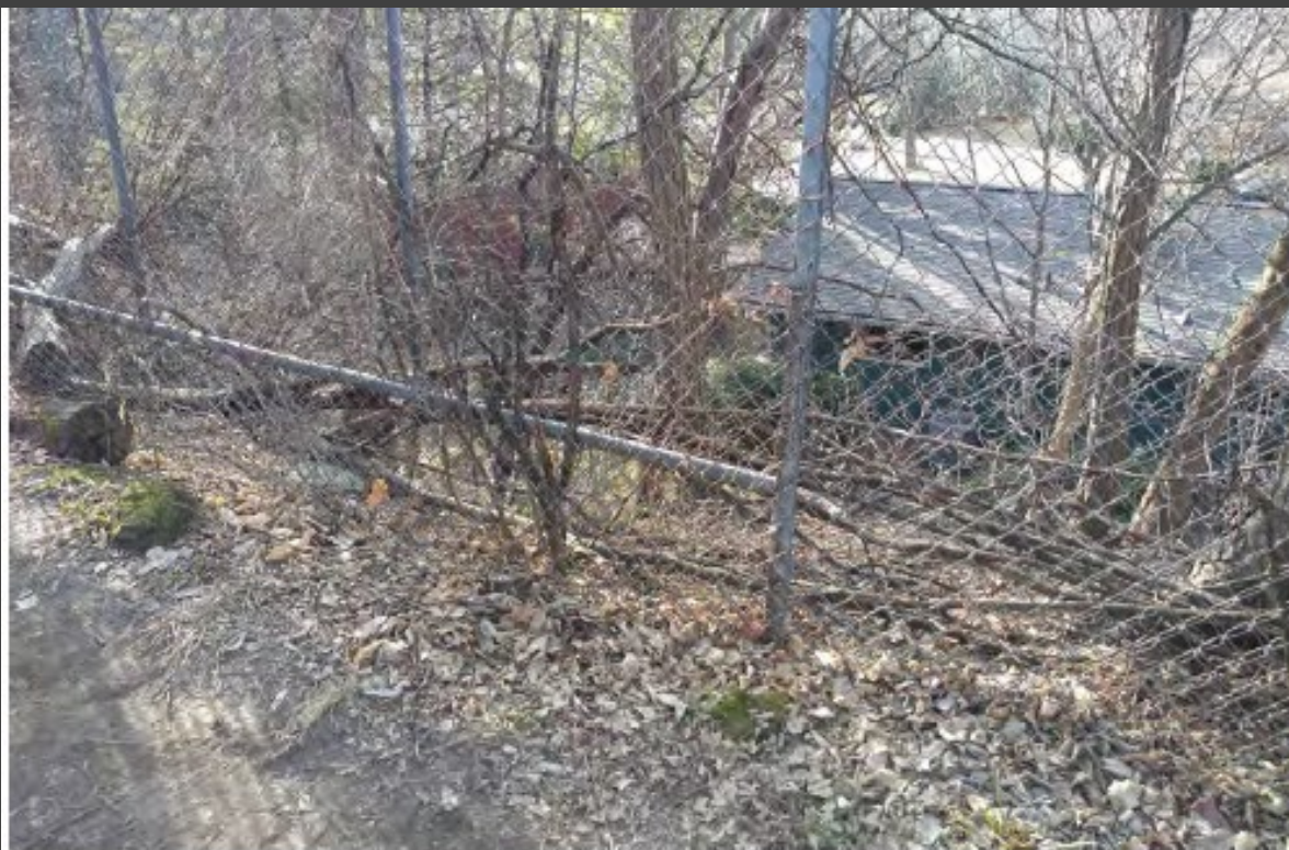
Existing trail, looking west over bluff towards DuRose Terrace.