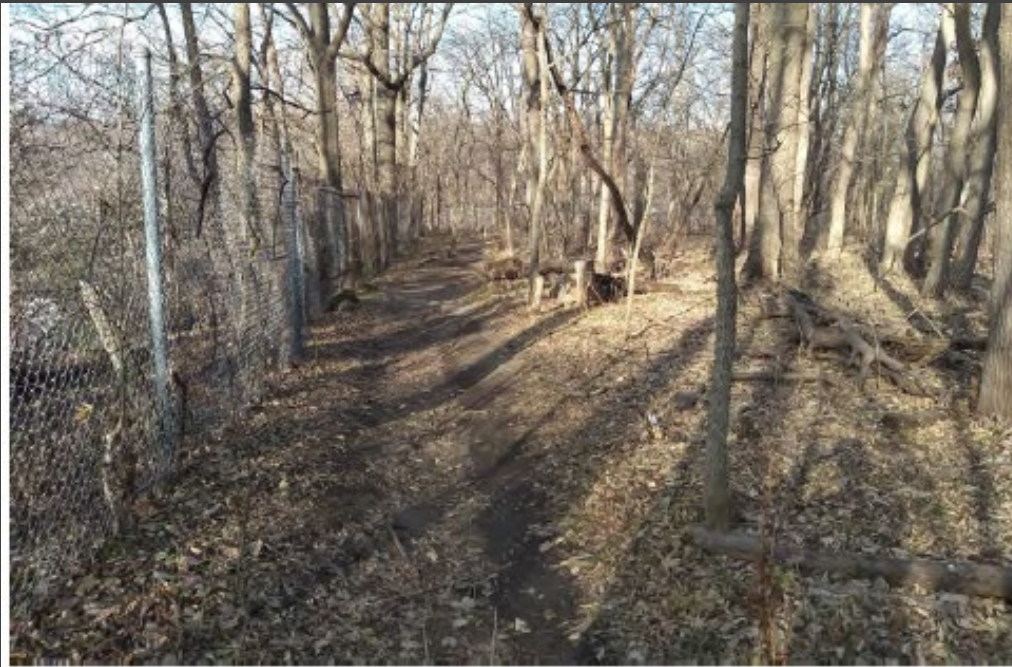
Existing trail, looking north.