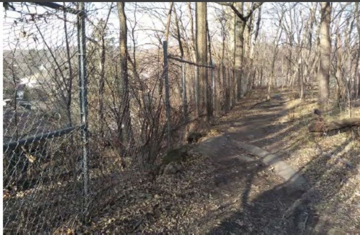
Existing trail with pavement to be removed, looking north.