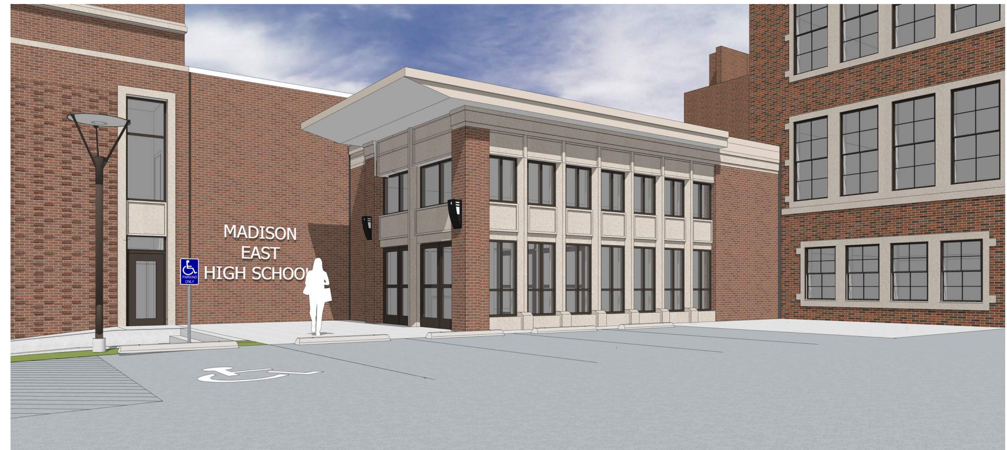
VIEW OF MAIN ENTRY