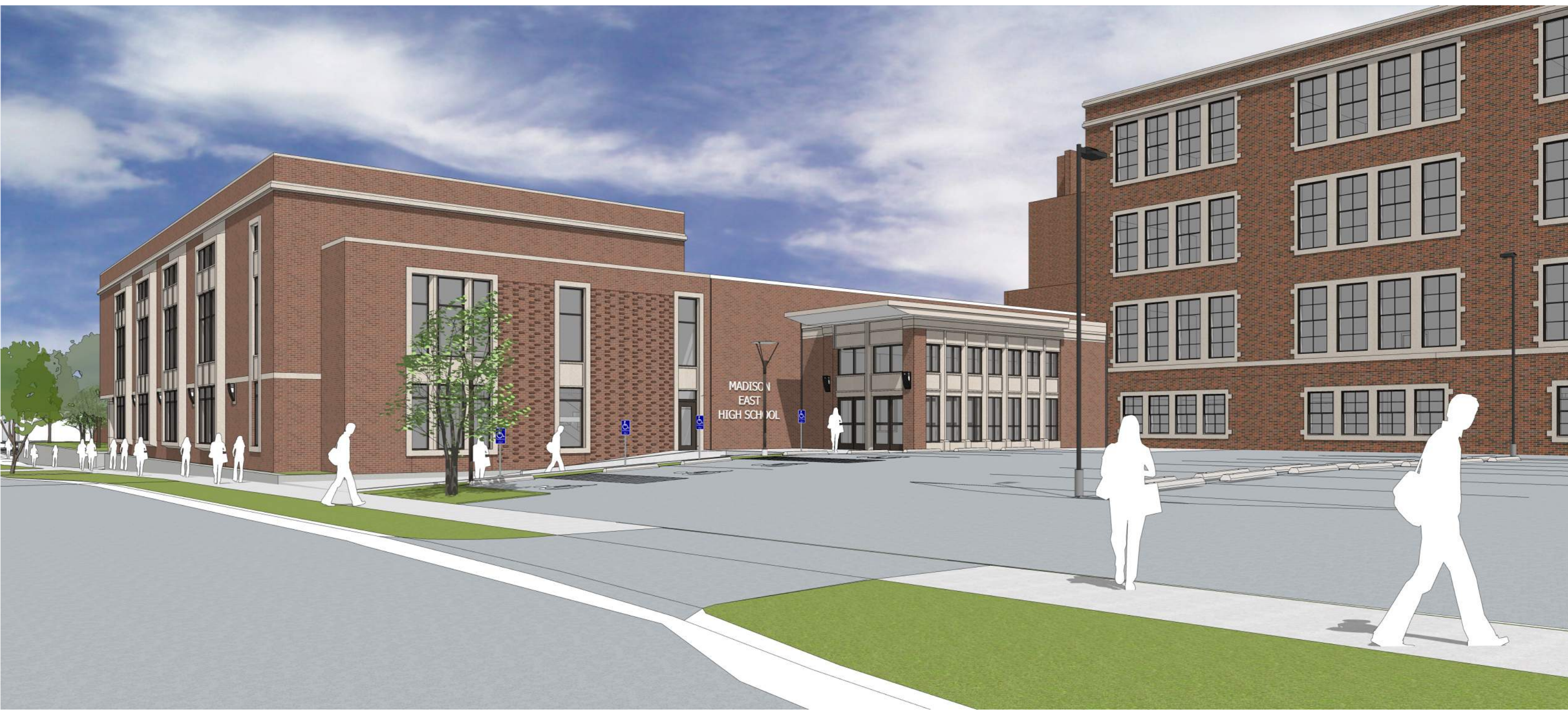
VIEW OF MAIN ENTRY