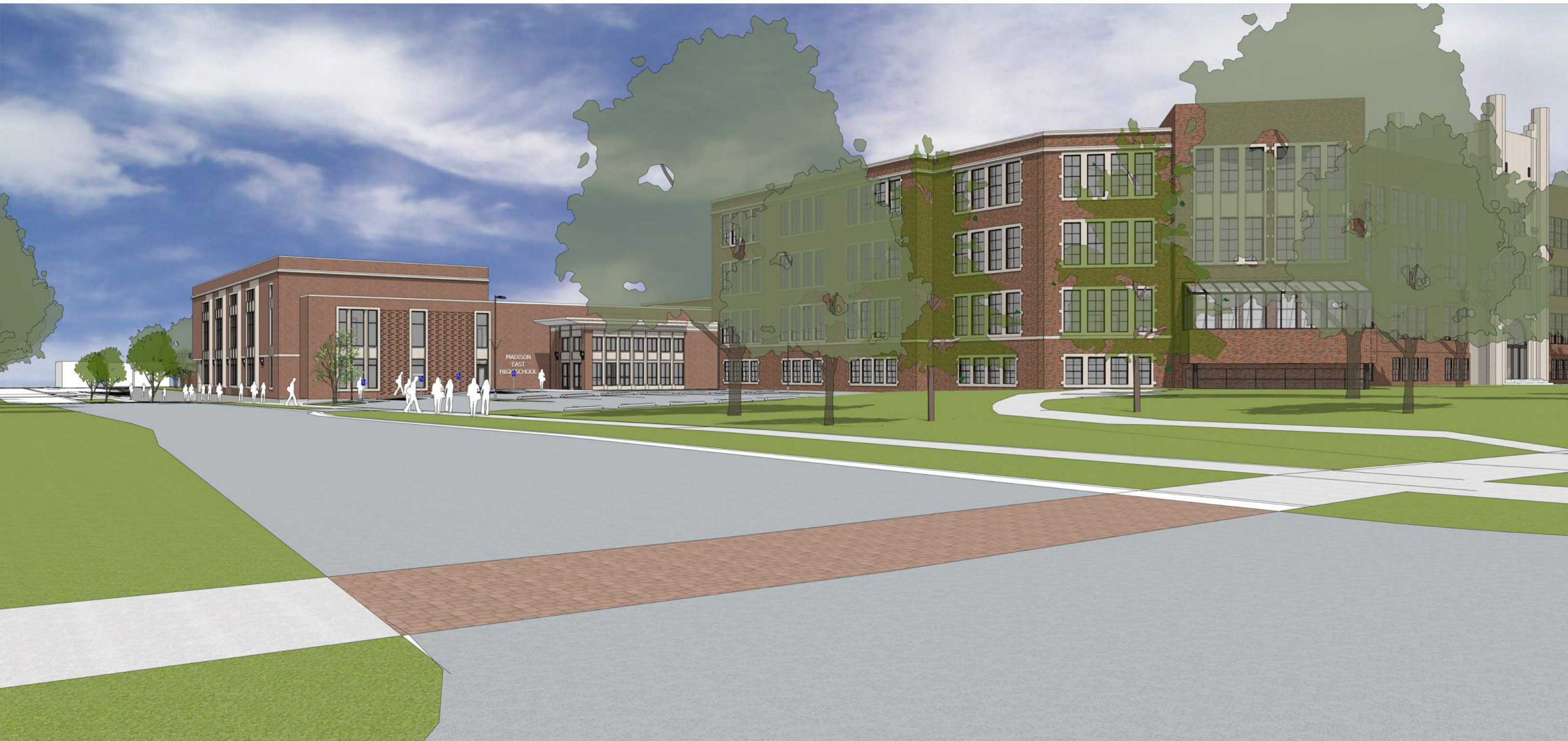
VIEW FROM EAST WASHINGTON AVENUE