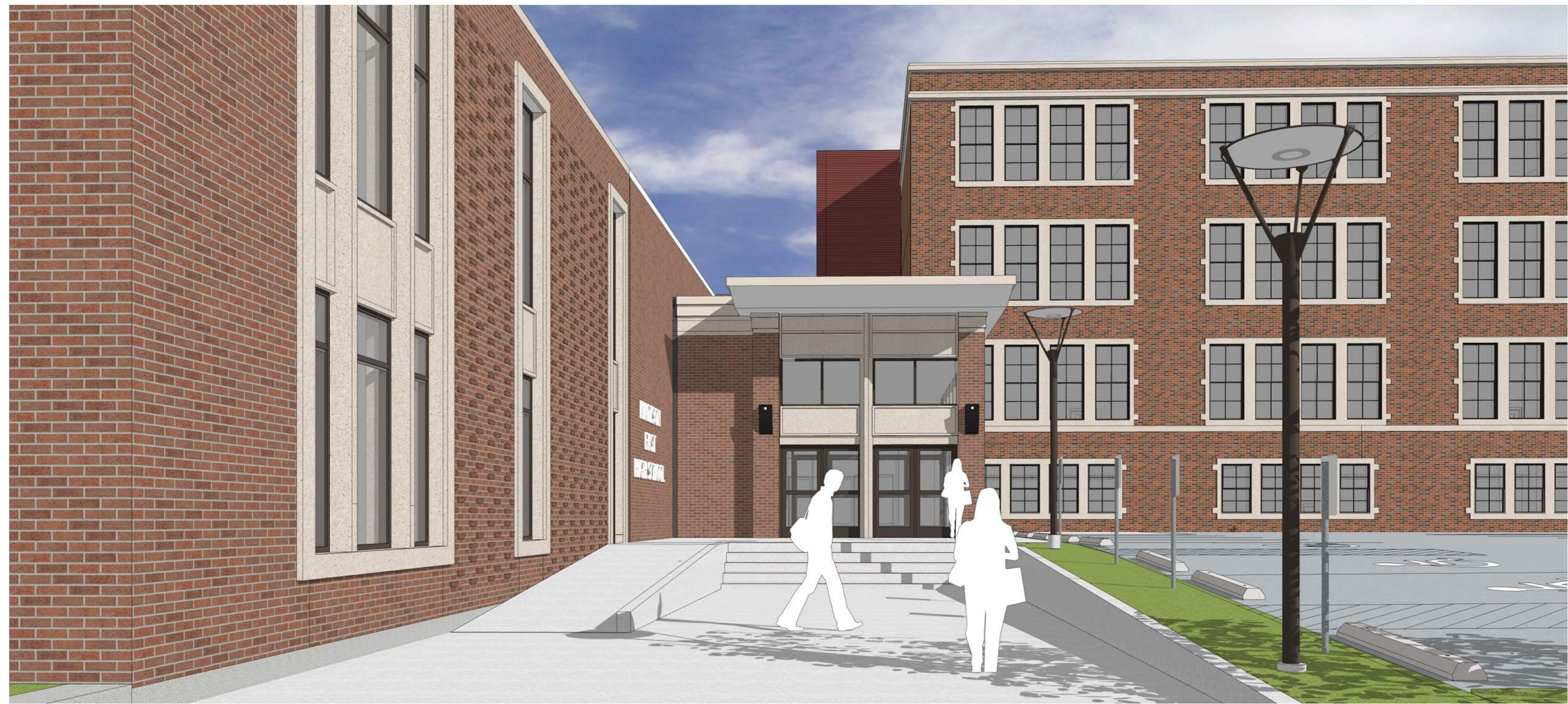
VIEW OF MAIN ENTRY