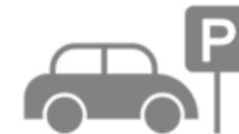
Parking management P-1 to P-4