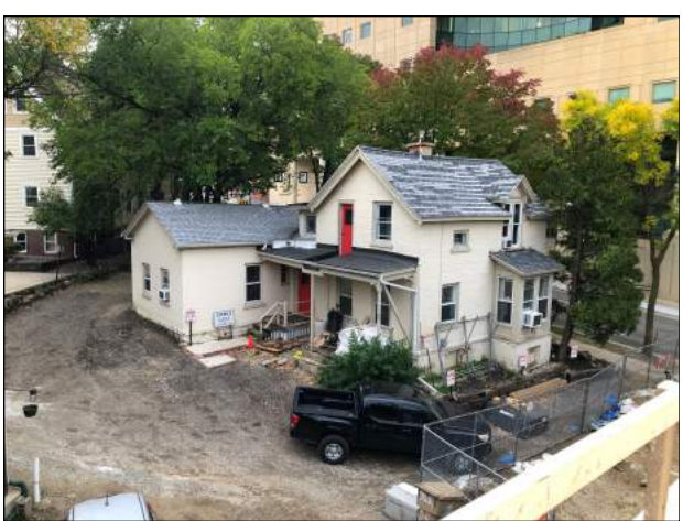
EXISTING BUILDING FROM REAR OF SITE