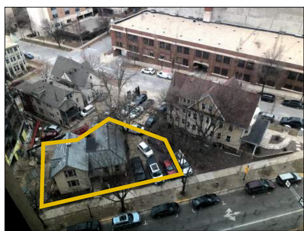
EXISTING SITE FROM S. HAMILTON

The applicant wishes to demolish an existing 2 story converted office building and construct a two story, 5671 gross square-foot Live/Work building with 400 square feet of ground floor commercial space and 4 owner occupied condominiums. The applicant proposes to commence construction in June 2021, with completion anticipated by the spring of 2022.