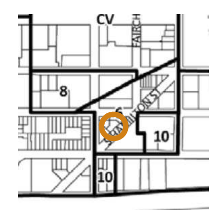
28.071(2)(a) Downtown Height Map