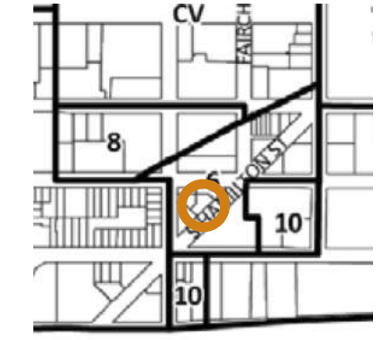
28.071(2)(a) Downtown Height Map