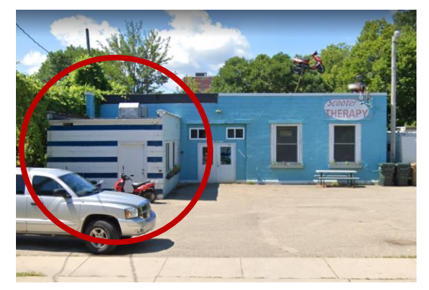
Image 2: Street View (from N Few Street) of the Portion Proposed for Demolition