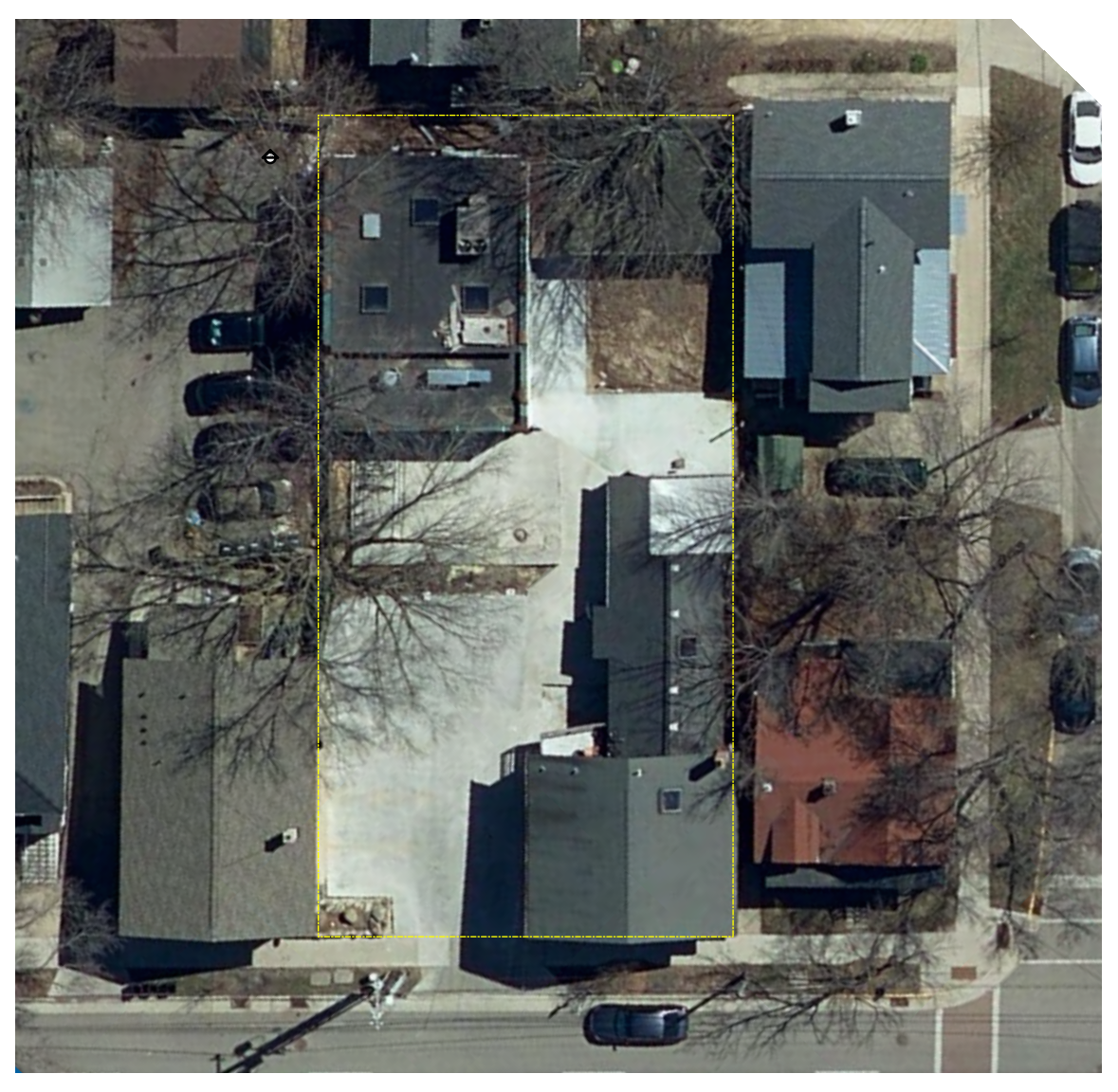
Vacinity @ 1" 30'