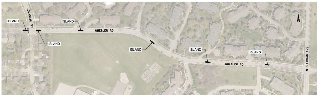
Proposed Island Locations

In addition to this survey, speed humps are also being proposed to the residents between Kennedy Road and Delaware Boulevard. However, this survey only concerns the proposed islands between Comanche Way and N Sherman Avenue.