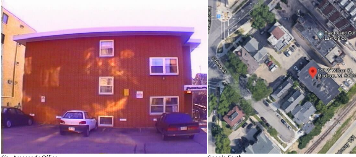
City Assessor's Office