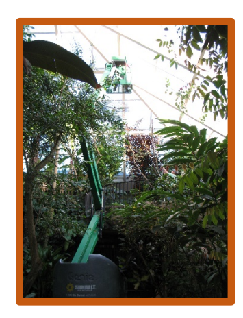
It takes staff 8 days to complete the pruning using this rented lift

Volunteers are slowly being invited back to their jobs. Greenhouse crews will begin transplanting in March – with schedules