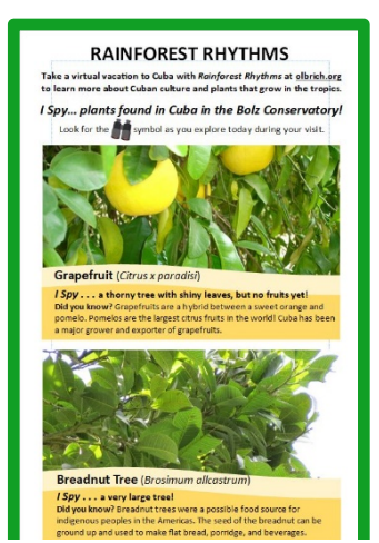
I Spy ...plants found in Cuba activity

The first Canopy Session was recorded on February 5 with Red Rose . One of their performers has offered to partner – pro bono – with OBG to provide quality streaming sound for future Canopy Sessions. Two additional dates have been added on March 19 and April 23. Canopy Sessions can be viewed online.