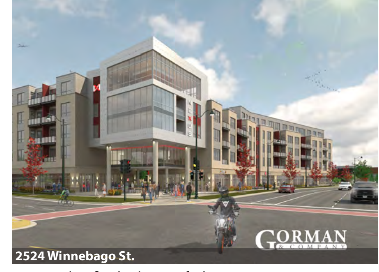
Nexus, the final phase of the Union Corners project, contains 105 dwelling units and ground floor commercial.