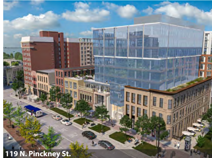
Nine story office building with 22,000 square feet of commercial space, 305,000 square feet of office space, and 844 underground vehicle parking spaces.