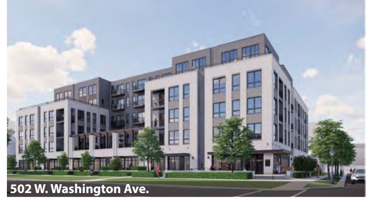
Six story mixed-use building with 2,300 square feet of commercial space and 103 apartments.