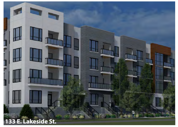
Redevelopment into a four-story building with 66 dwelling units and 1,240 square feet of commercial space.