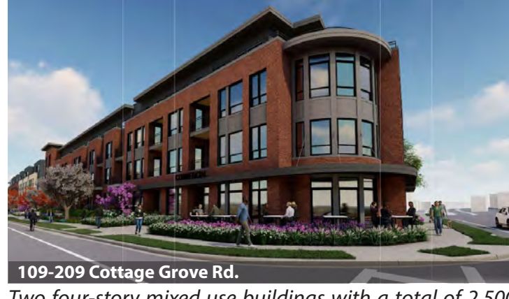
Two four-story mixed use buildings with a total of 2,500 square feet of commercial space and 188 dwelling units.