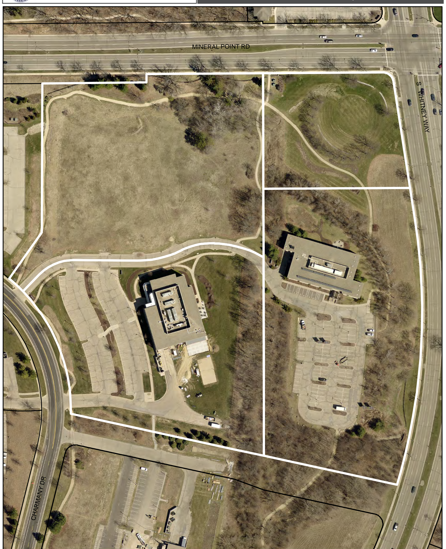
Date of Aerial Photography : Spring 2018