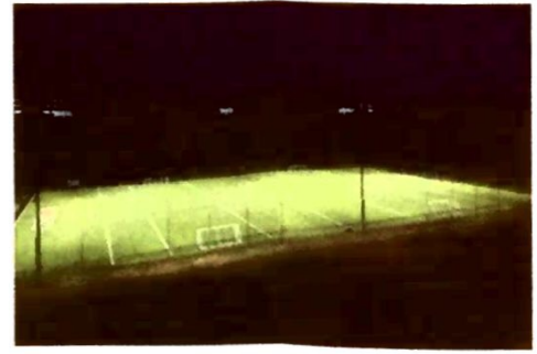
An example of Edgewood's proposed lighting system installed at Clemson Field

Lighting: The amended plan includes the incorporation of the latest LED lighting technology that will minimize glow, light spill and glare. This new technology, along with the height of the poles in our plans, will ensure that lighting from the limited number of night games will not go beyond our property. The plan meets and even exceeds the City lighting requirements.