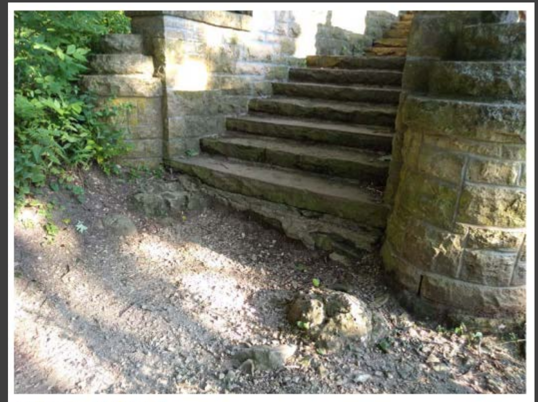
3. Existing north stairs