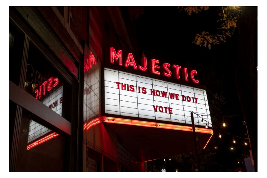
YOU VOTE 2020 Marquee Installation: Madison, Wisconsin, USA © 2020 Jenny Holzer, member Artists Rights Society (ARS), NY

And the marquee billboard takeover is happening at four Madison locations: Four marquees including the the Barrymore Theater, the Orpheum Theater, the