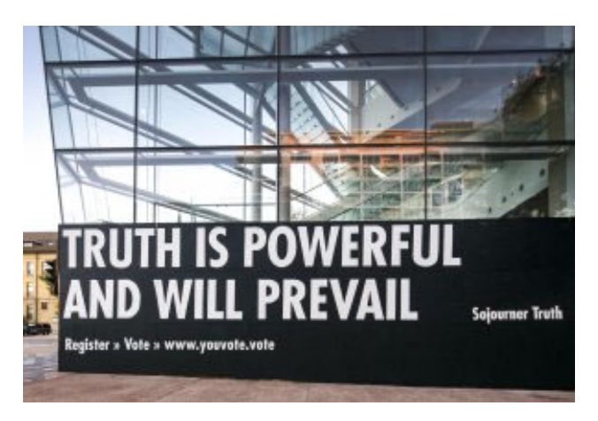
YOU VOTE 2020 Mural Text: Sojourner Truth Installation: Madison, Wisconsin, USA, 2020

And the large-scale mural at MMoCA features a quote by abolitionist and women's rights activist Sojourner Truth: "Truth is powerful and will prevail."