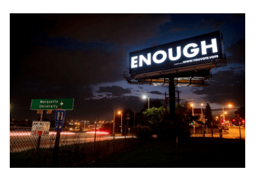
"Enough" billboard in Milwaukee. Provided by YOU VOTE 2020 by Jenny Holzer www.youvote.vote

message about the importance of voting, issue awareness and empowerment. The artwork is appearing in a variety of different mediums tied to the arts,