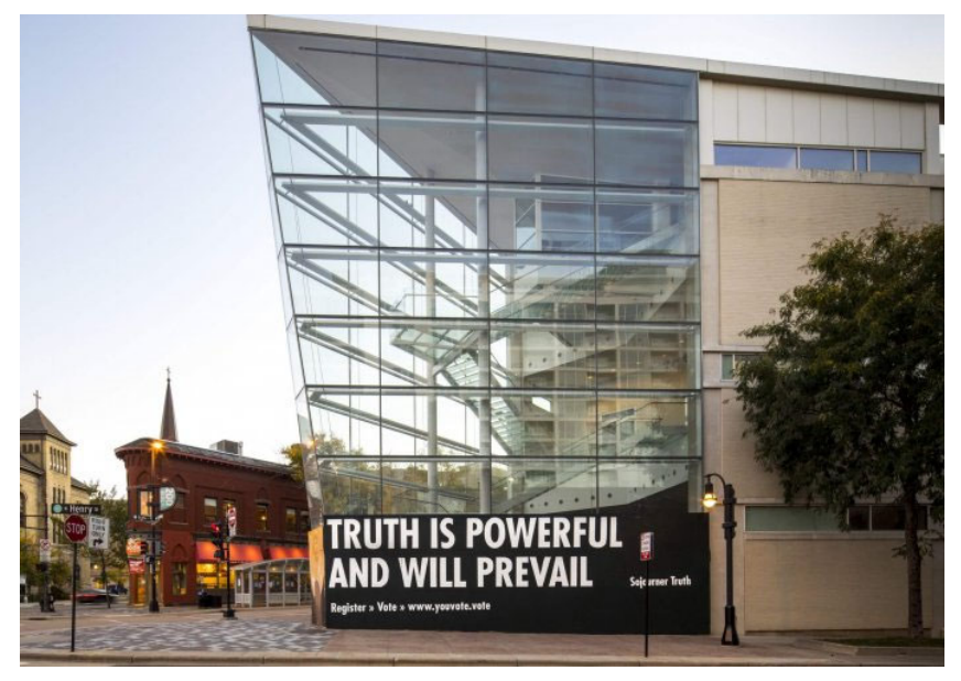
YOU VOTE 2020 Mural Text: Sojourner Truth Installation: Madison, Wisconsin, USA, 2020 © 2020 Jenny Holzer, member Artists Rights Society (ARS), NY

Artwork by internationally acclaimed artist Jenny Holzer has a place in the permanent collection of the