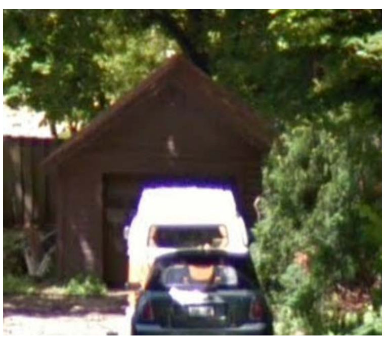
Garage at 1710 Kendall

Legistar File ID #62610 302 Lathrop Street November 2, 2020 Page 4 of 4