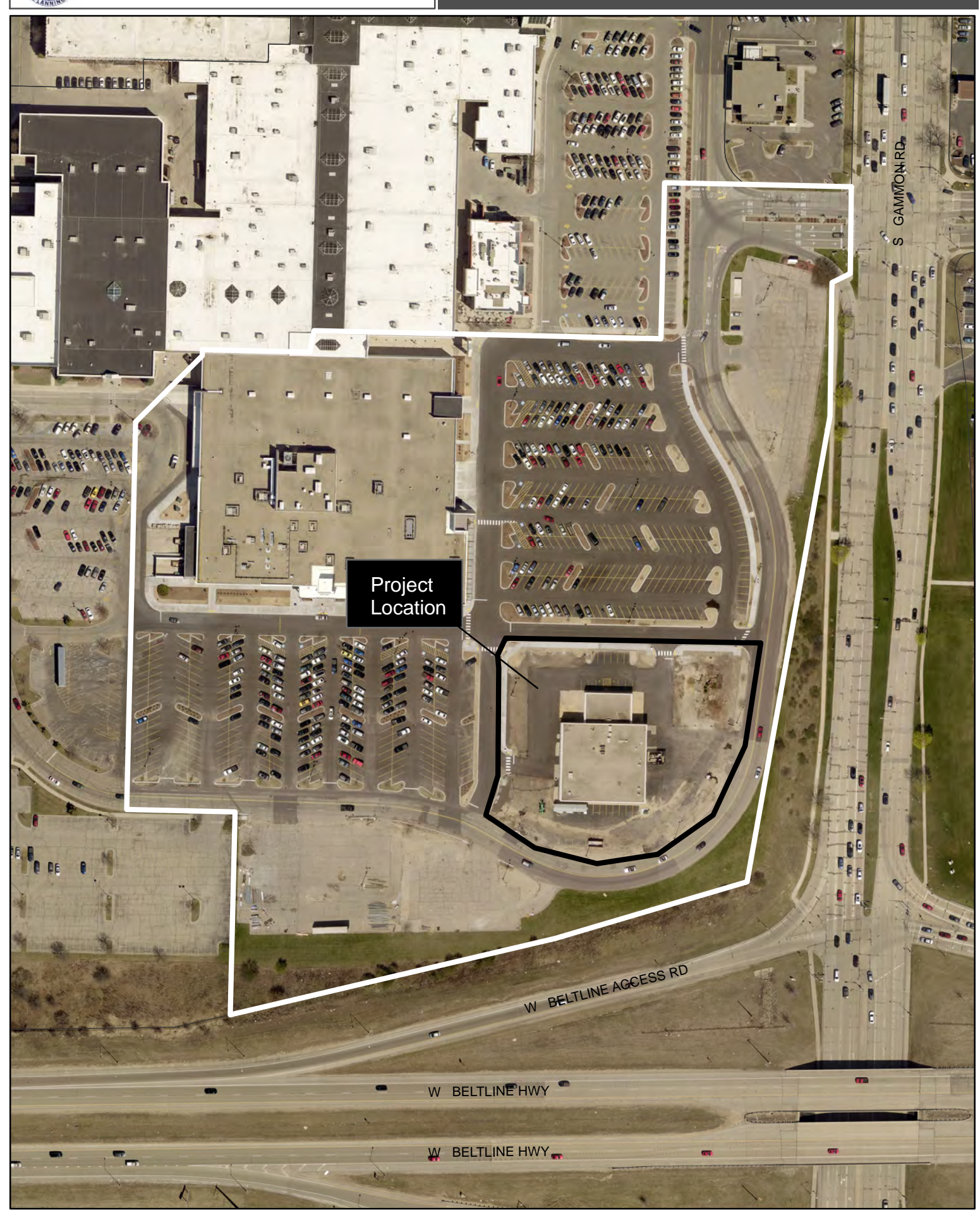
Date of Aerial Photography : Spring 2018