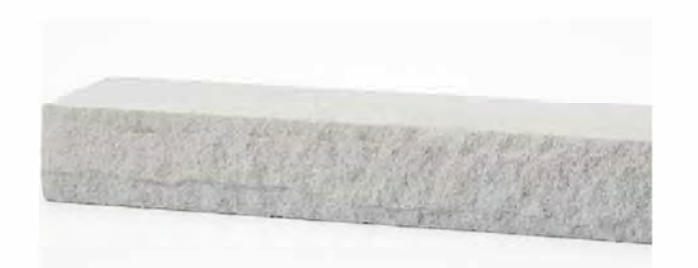
Arriscraft White Rocked Georgia Sill