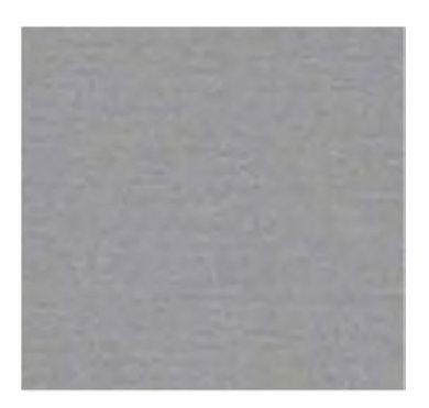
Silversmith - PAC-Clad