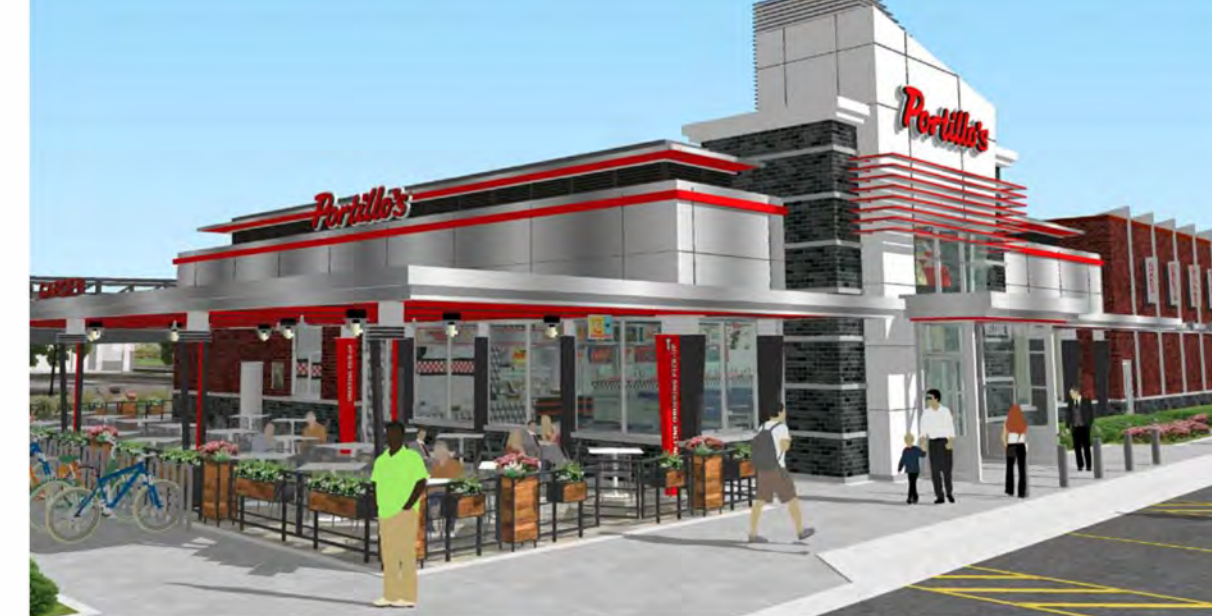
Portillo's Diner - Streetview 3D Color Rendering for Reference