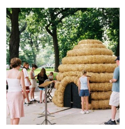
"The Beehive Project" by Chele Isaac, was an interactive public art project consisting of a large scale beehive, featuring a queen bee inside typing a story on an old typewriter. The public participated by helping to write the story.