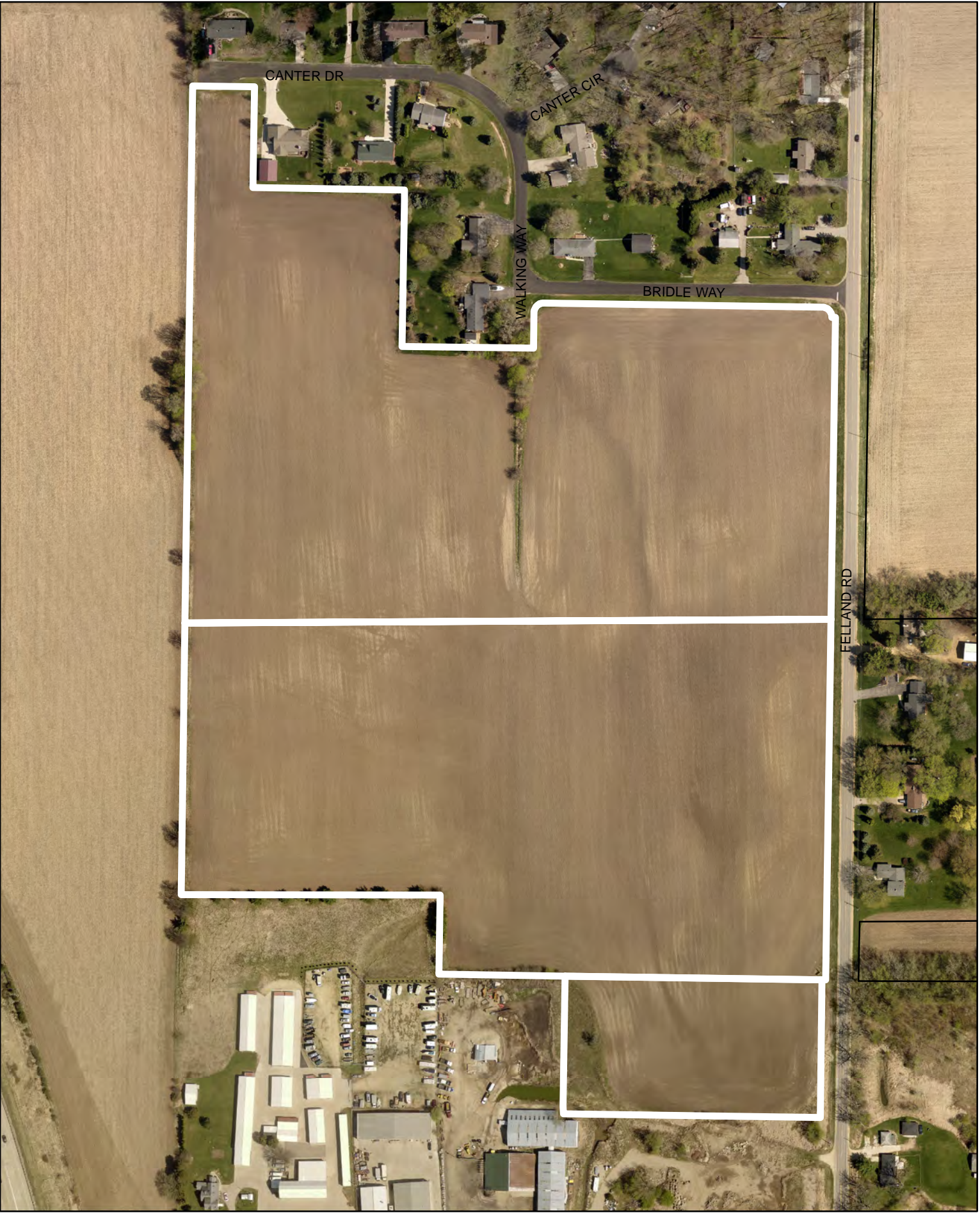
Date of Aerial Photography : Spring 2018