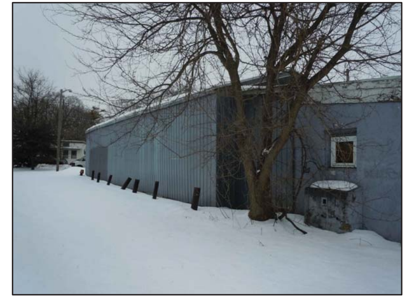
210 S. BALDWIN ST. EXTERIOR