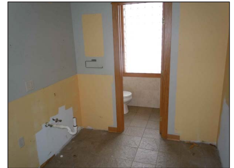
212 S. BALDWIN ST. INTERIOR