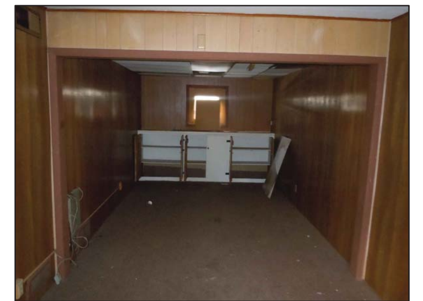
210 S. BALDWIN ST. INTERIOR