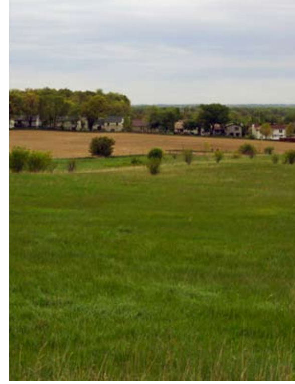
Image 11: Photo of the existing Raemisch Property site looking north toward Whitetail Ridge Neighborhood.