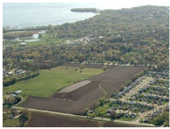
Image 10: Bird's eye view of the Raemisch Property with Lake Mendota at the top of the image and CTH CV in foreground.