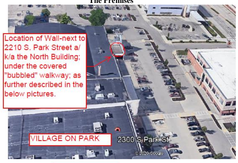
EXHIBIT B The Premises