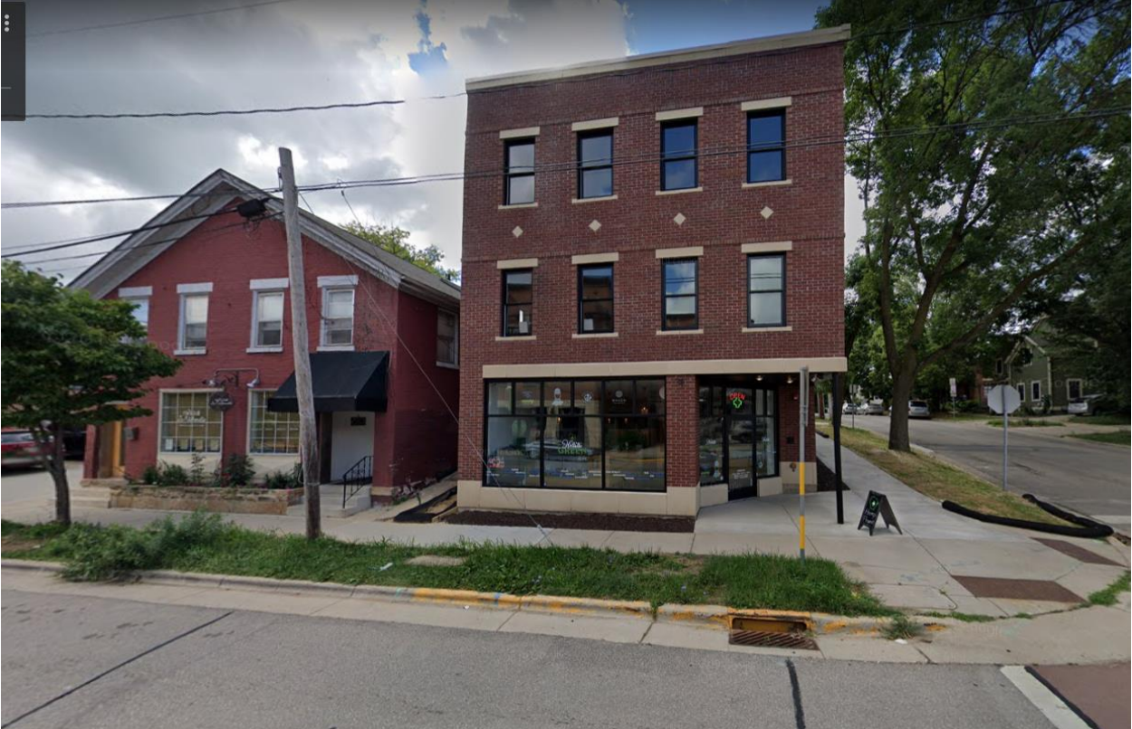
Google Street Map Oct 2016 and Jul 2019