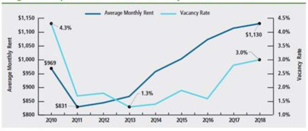
Figure 14. Apartment Rents and Vacancy Rates in the Madison HMA

Or look at HUD data that compares the vacancy rate to the average rental rate.