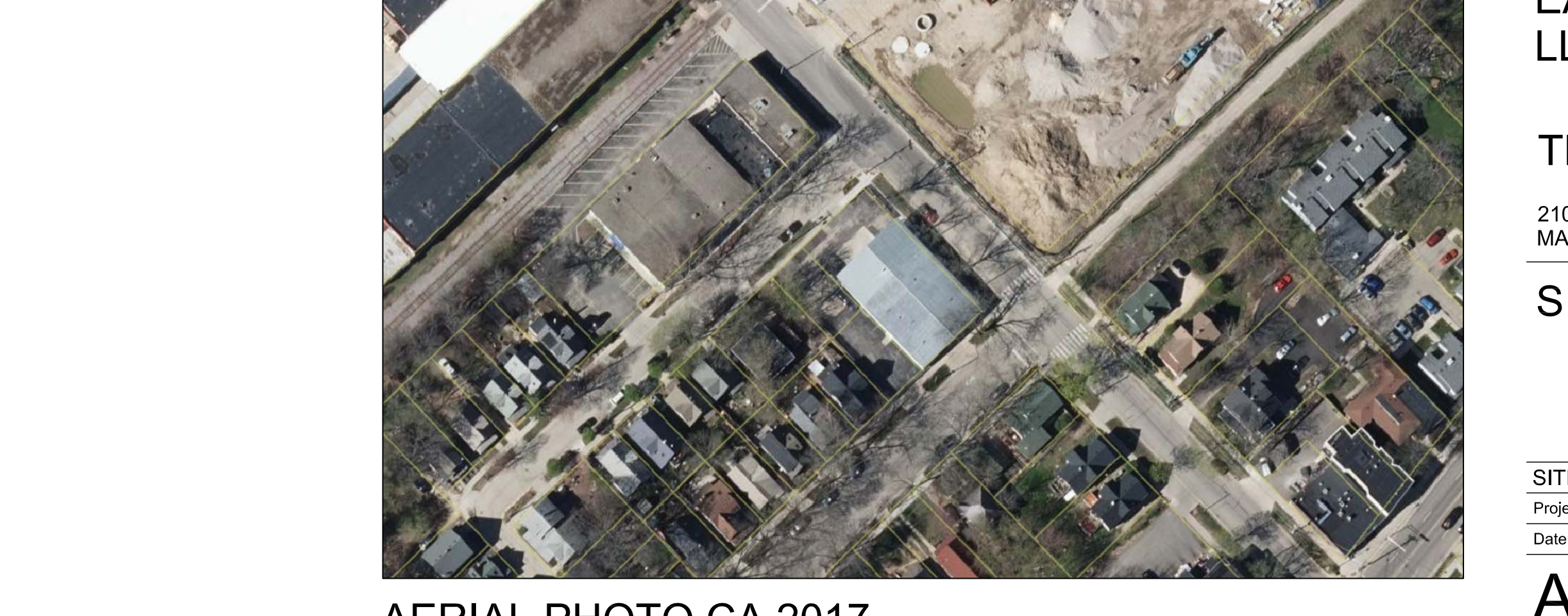
AERIAL PHOTO CA 2017