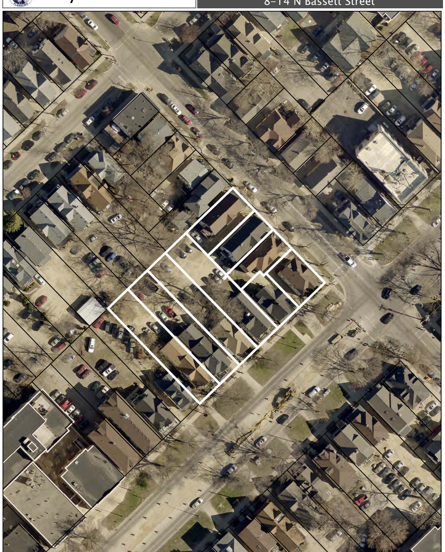
Date of Aerial Photography : Spring 2018