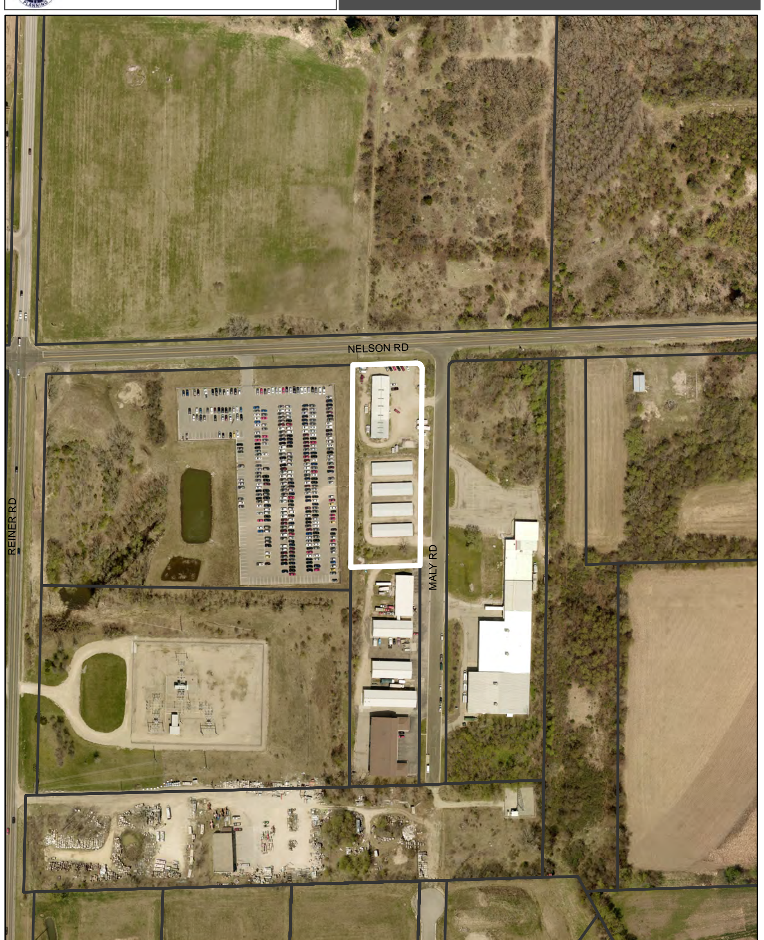
Date of Aerial Photography: Spring 2018