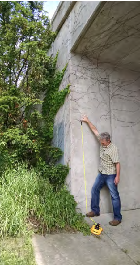
EXISTING CONDITIONS (WEST WALL)