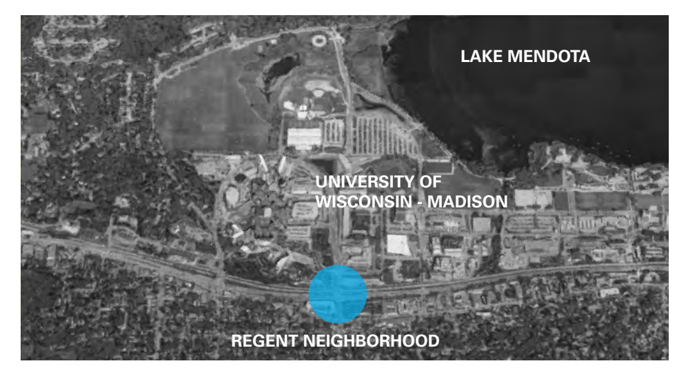
CONTEXT MAP Gateway location between Regent Neighborhood and UW-Madison Campus

Fabrication, lighting consultation and installation will be sourced locally from the Milwaukee-Madison area. Engineering, construction document consultation and electrical services will be provided by the City of Madison. The artist requests use of city storage facilities for panels, frames, and lighting fixtures between fabrication and installation to defray costs.