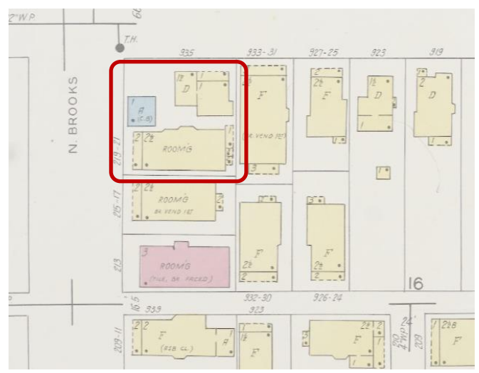
1950 Sanborn Fire Insurance Map

Legistar File ID # 59133 & 59810 935 W Johnson April 9, 2020 Page 4