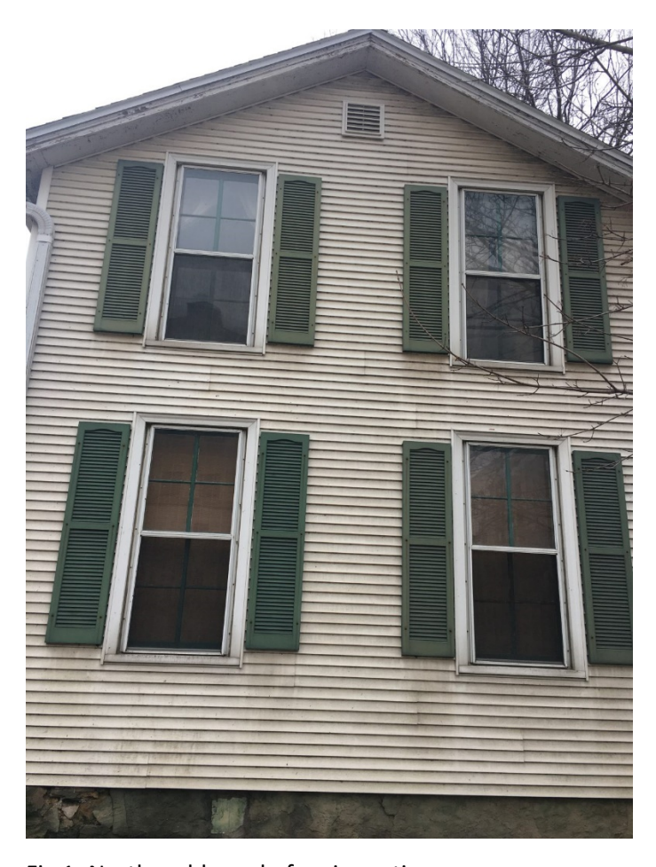
Fig 1: North, gable end of main section