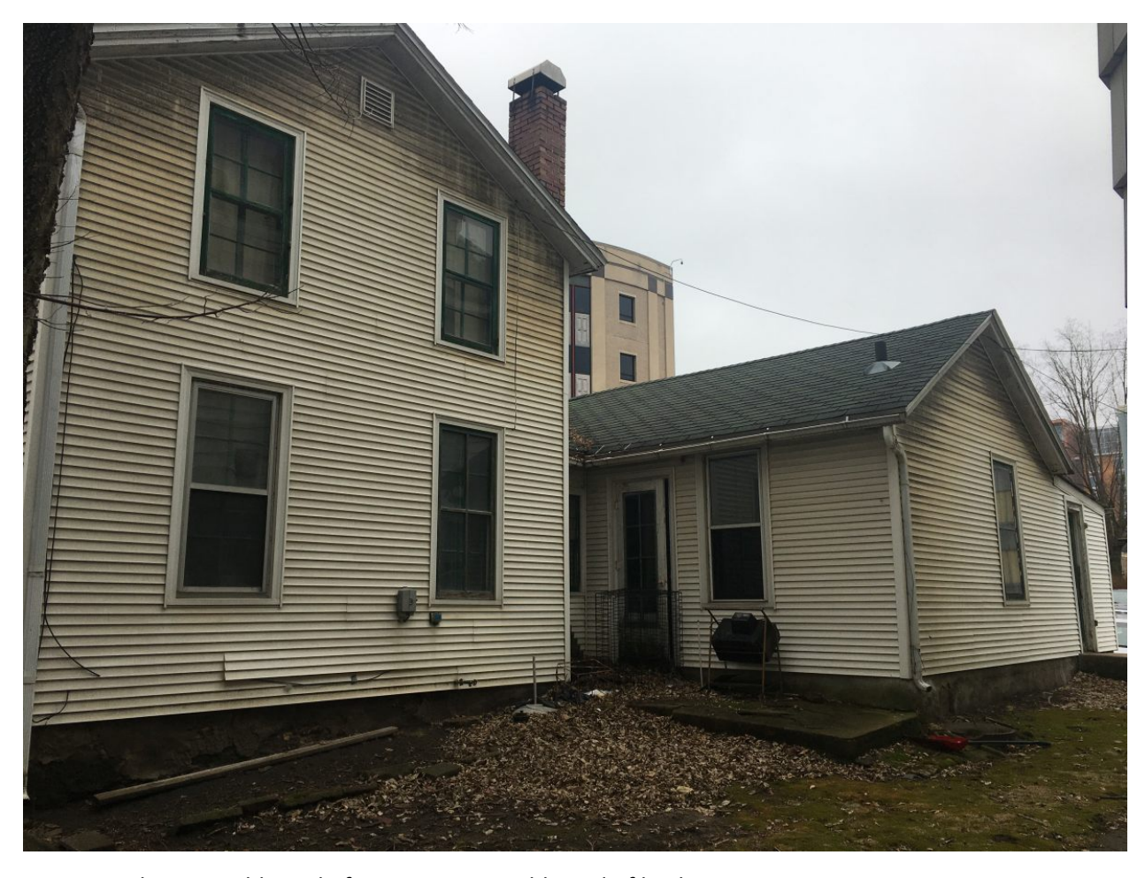
Fig. 7: South view, gable end of main section, gable end of kitchen.