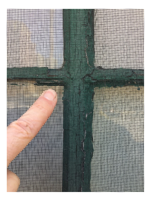
Fig. 11: Muntin detail on window, showing wider vertical member.