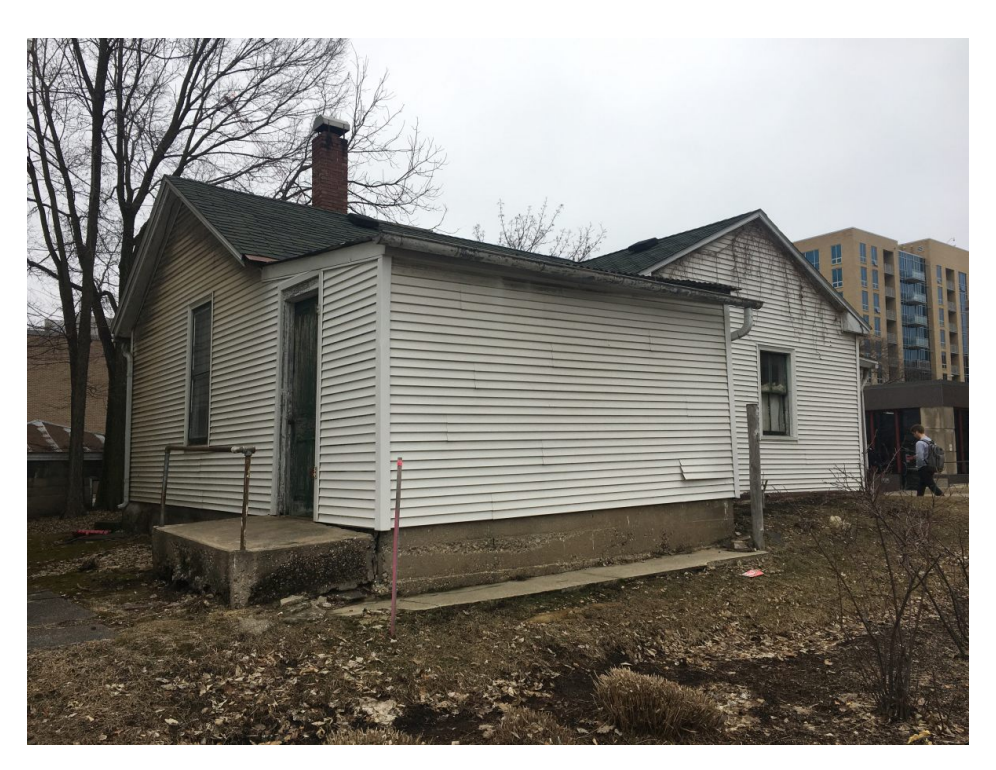
Fig. 6: Southeast view, laundry and storage, gable end of kitchen.