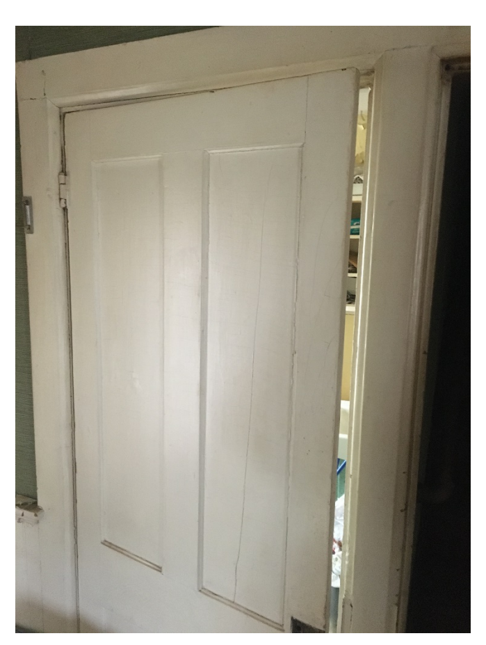
Fig. 14: Detail of solid, 4-panel interior door and casing, leading to bathroom.