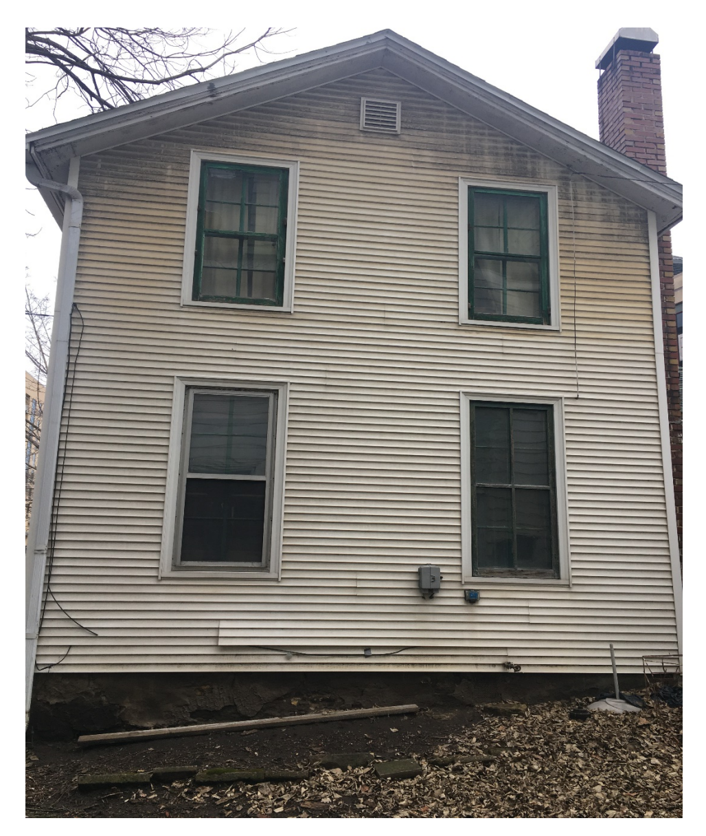
Fig. 8: Gable end, rear main section.