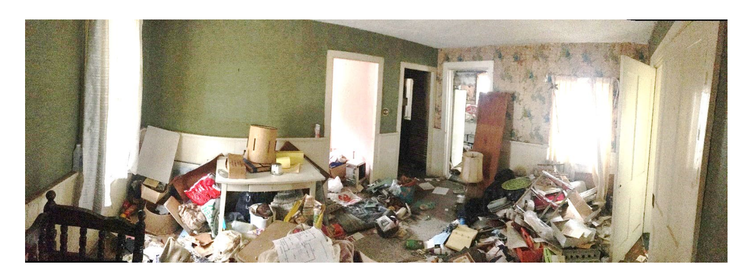
Fig 13: Interior panoramic view, living room. Bedroom door is left center. Kitchen door is right-center. Bathroom door is to right. Half wall wainscoting.