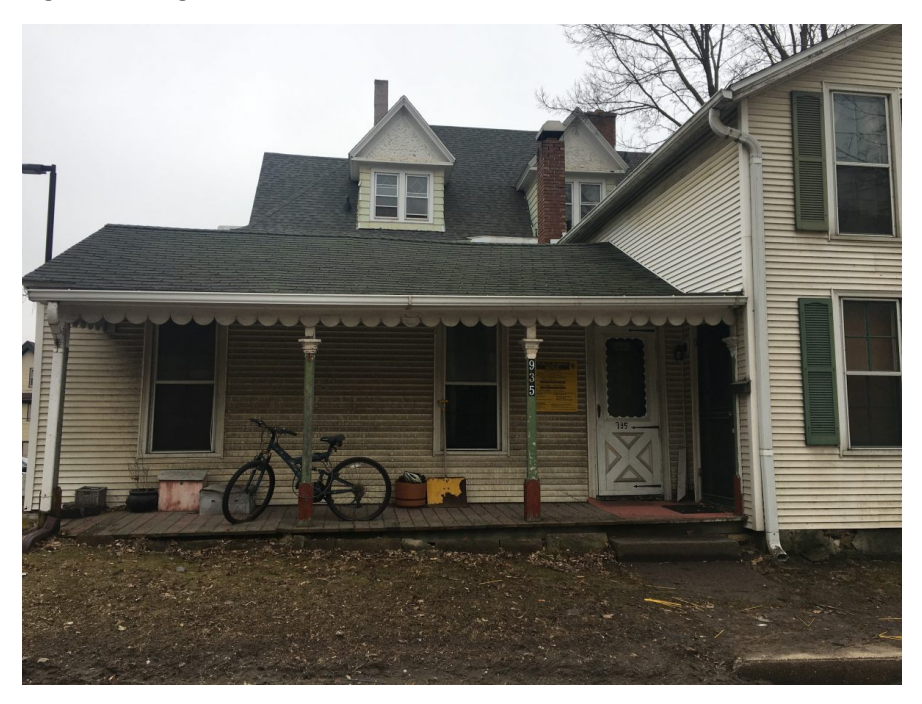
Fig 2: North, porch El section