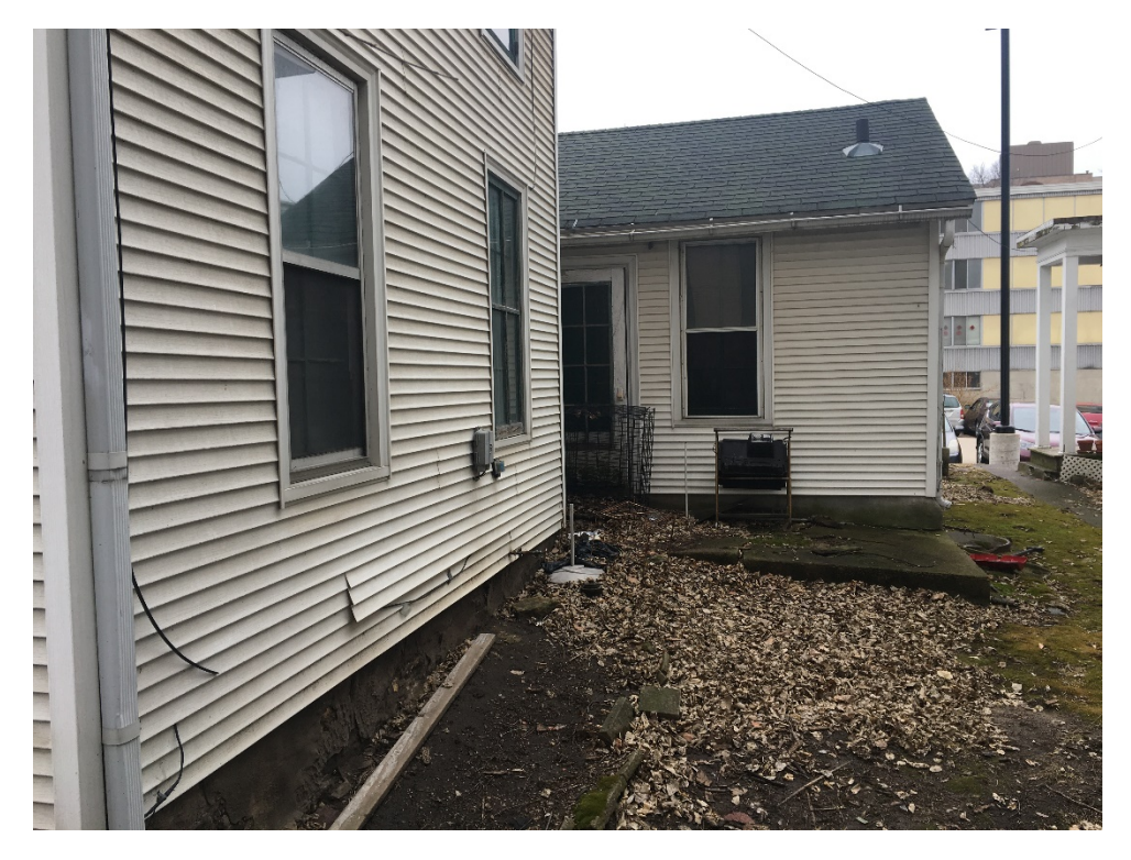
Fig. 9: West view, gable end of main section, west wall of kitchen.