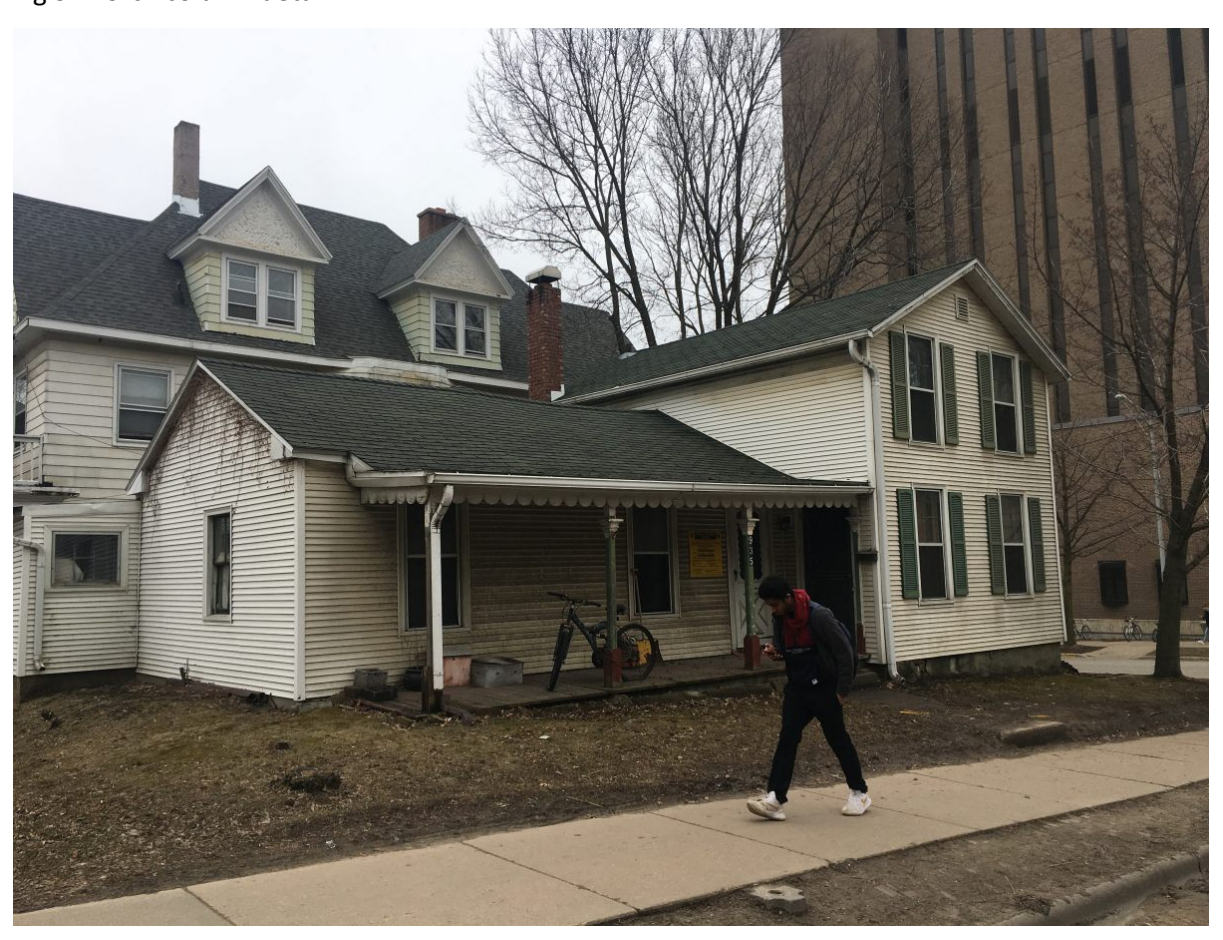
Fig. 4: Northeast corner, porch, El and main section