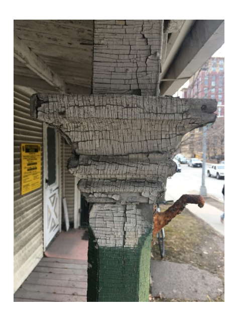
Fig 3: Porch column detail