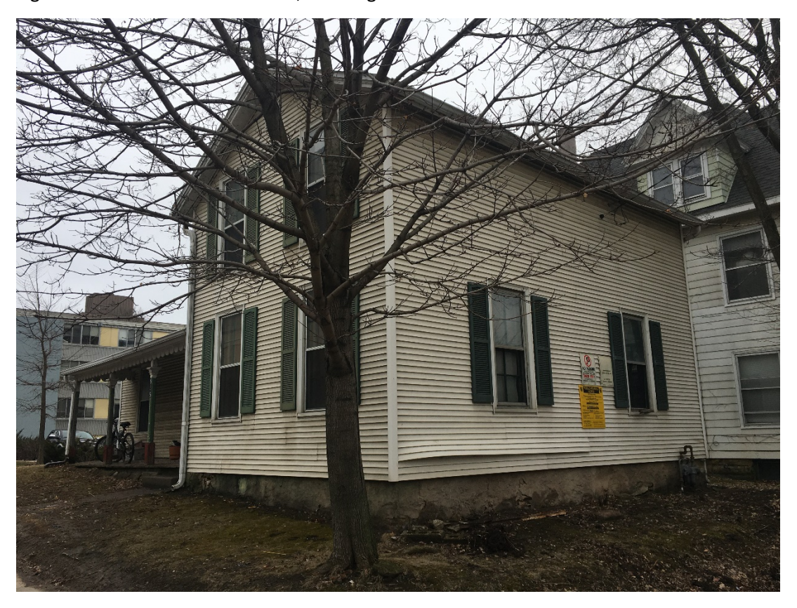
Fig. 12: Northwest view, main section gable end and west elevation.