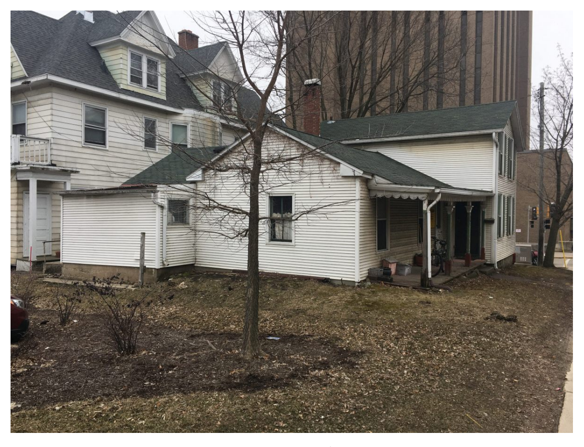
Fig. 5: East view, gable end of El section, and laundry/storage.