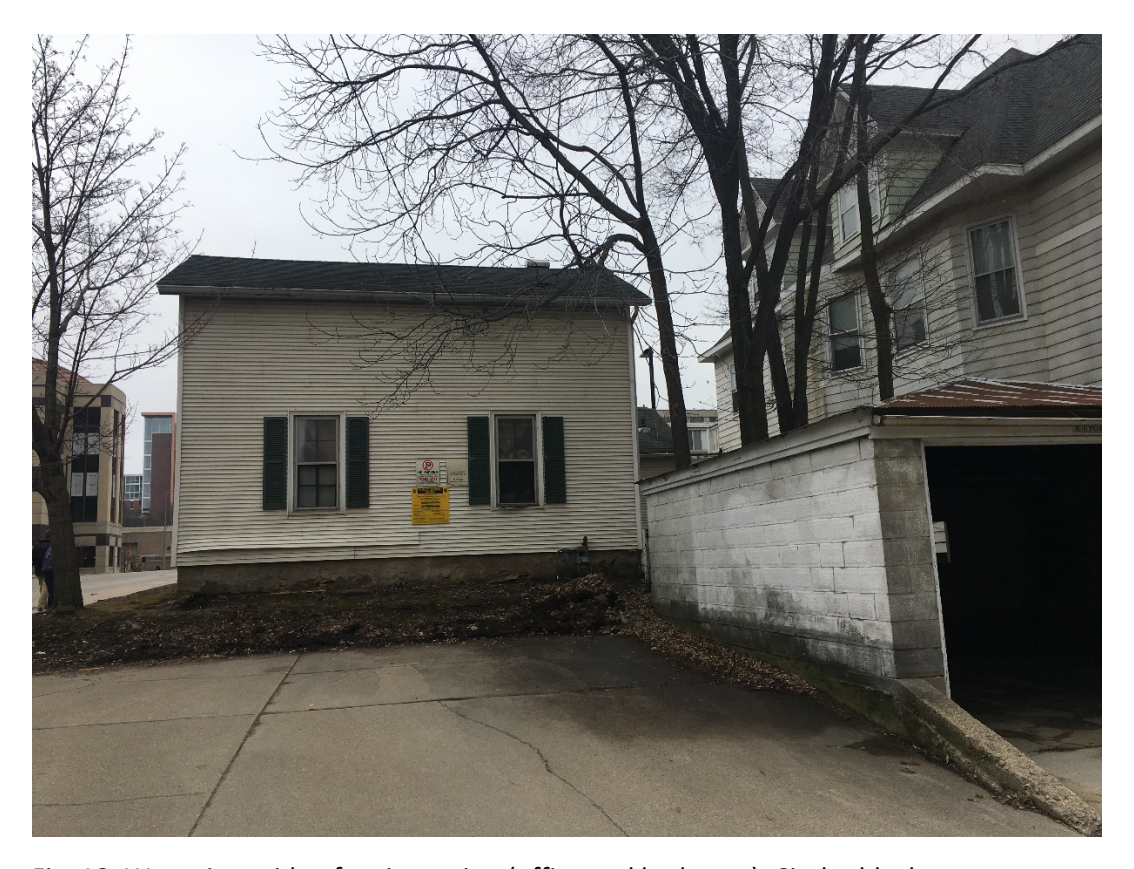
Fig. 10: West view, side of main section (office and bedroom). Cinder block garage.