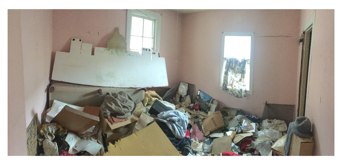
Fig. 15: Interior panoramic view, first floor bedroom.