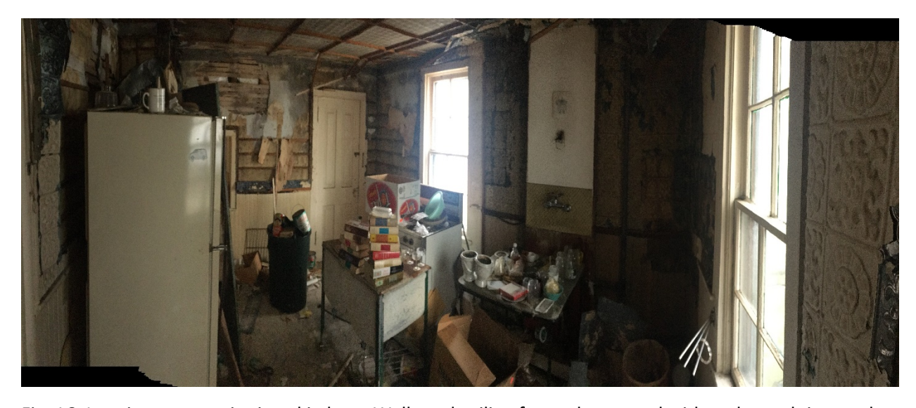
Fig. 16: Interior panoramic view, kitchen. Walls and ceiling formerly covered with embossed tin panels, now mostly removed to expose plaster and wood lath walls.