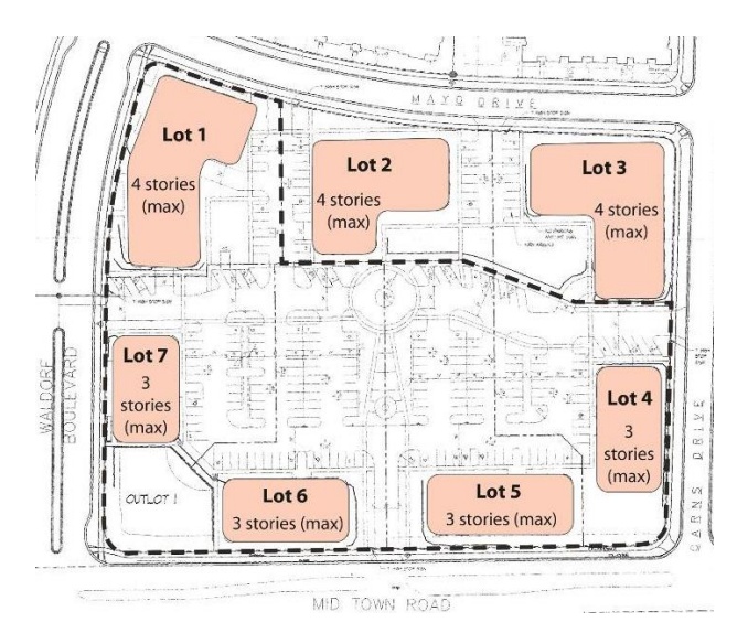
Image 4: (left) The seven buildings proposed in the 2007 Midtown Center GDP (five are located on the subject property, which is outlined); (right) the three proposed buildings

Whereas the Comprehensive Plan and High Point NDP both recommend buildings to four stories (with an exception in the case of the NDP, which allows larger buildings "in very select locations"), the applicant is proposing three buildings that range from four to six stories. (See Image 4, below)