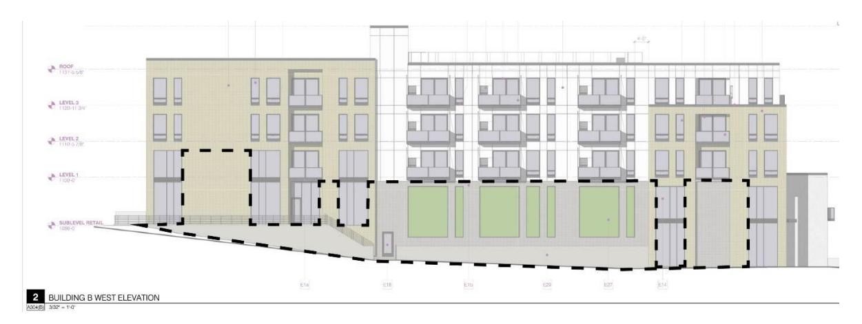
Image 5: The blank façade area along the base of the western façade of Building "B"

Regarding building heights, Staff note that the other two buildings on the block, located on Midtown Center Lots 2 and 3, stepped down along the way to maintain the four-story height. (See Image 6, below). In comparison, the proposed development exceeds four and five stories as shown on the submitted plans.