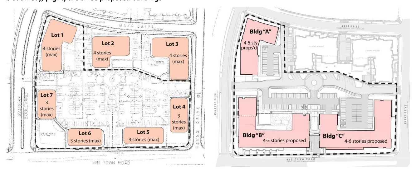
Image 2: (left) The seven buildings approved in the 2007 Midtown Center GDP (five are located on the subject property, which is outlined); (right) the three proposed buildings

4. Increase in the number of residential units on the subject property.