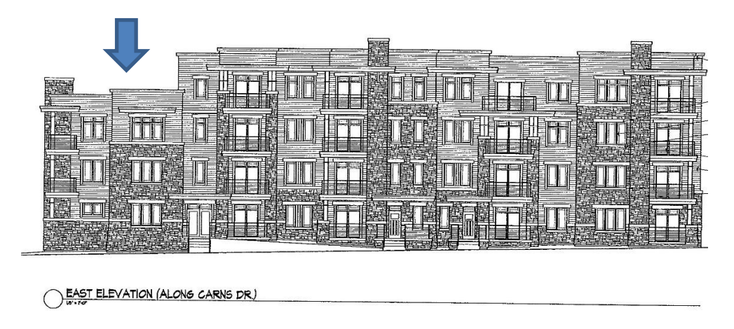
Image 6: The east elevation of the residential building located on Midtown Center Lot 3 (8101 Mayo Drive), stepping down with the change in grade

Regarding building heights, Staff note that the other two buildings on the block, located on Midtown Center Lots 2 and 3, stepped down along the way to maintain the four-story height. (See Image 6, below). In comparison, the proposed development exceeds four and five stories as shown on the submitted plans.