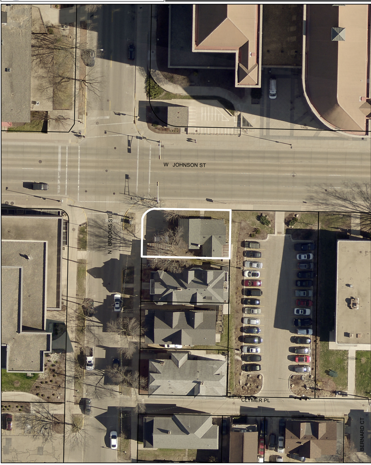
Date of Aerial Photography : Spring 2018