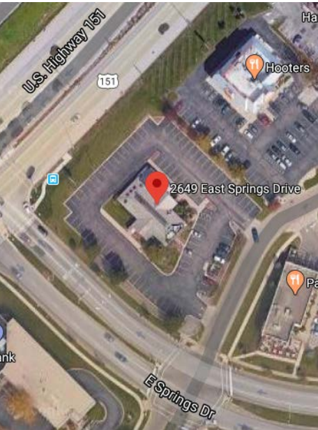
City Assessor's Office