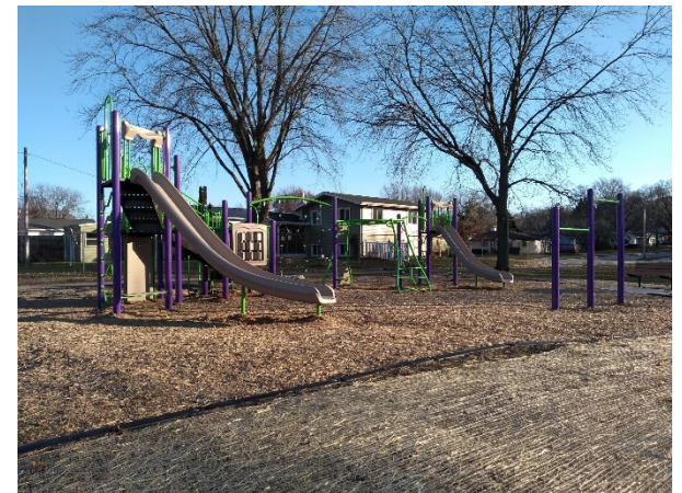
Sherman Village Park Playground