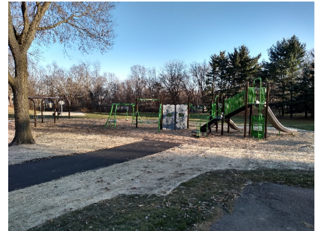
Lake View Park Playground