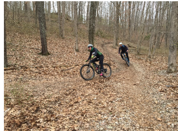
Single Track Bicycle Network Feasibility Study