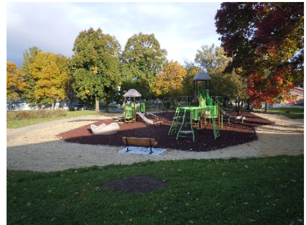
Penn Park New Playground