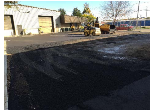
Summit Maintenance Facility Parking Lot