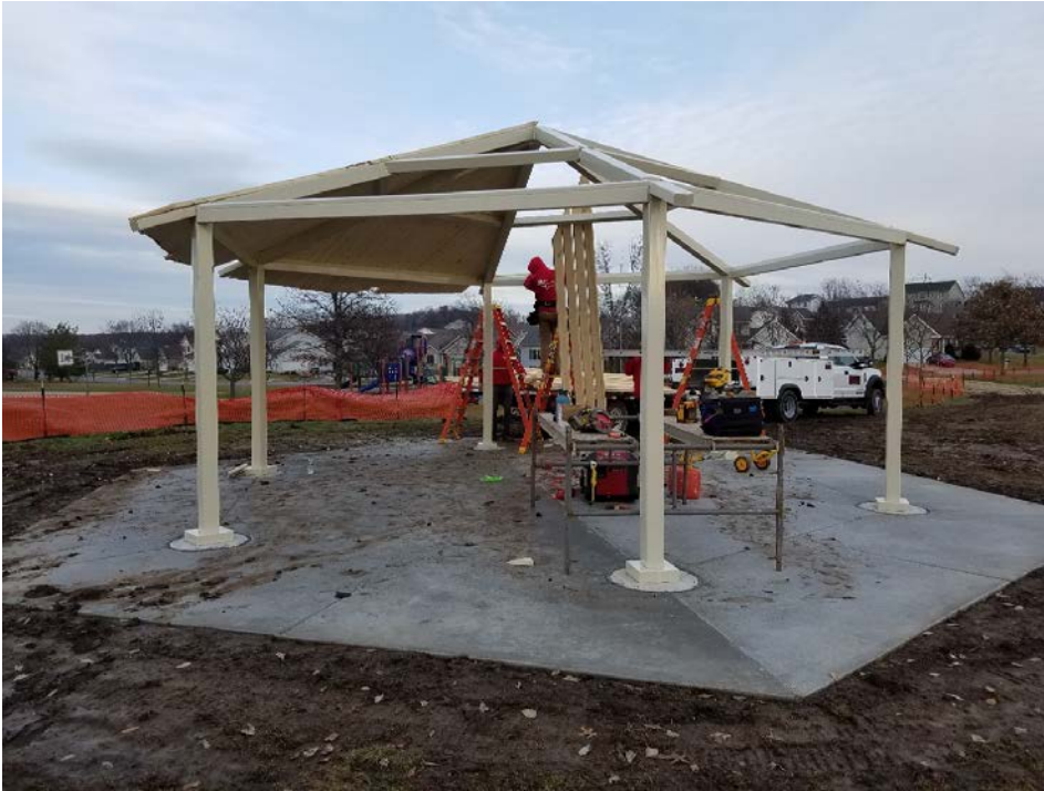
Glacier Hill Park Sun Shelter