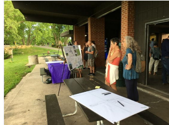
Vilas Park Master Plan