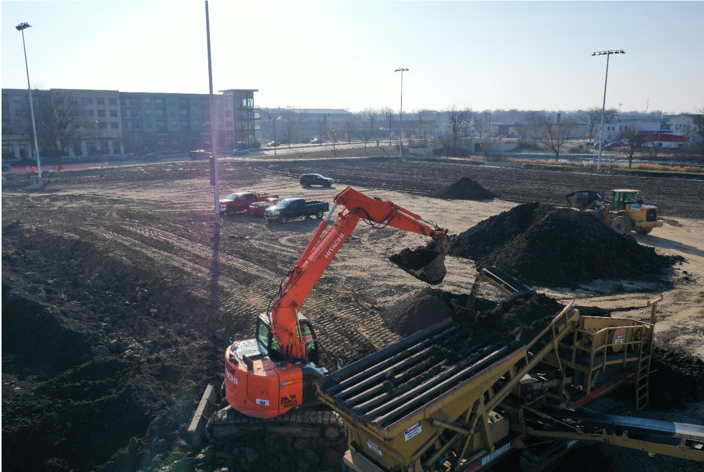
Burr Jones Park – Site Improvements Looking Southwest