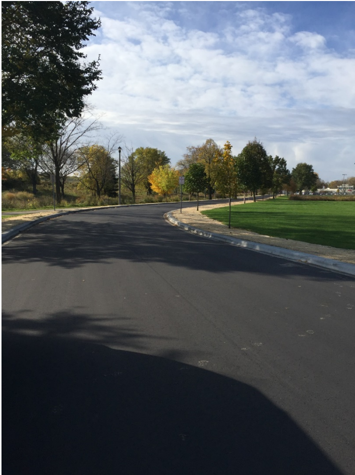
Wingra Creek Parkway / Goodman Maintenance Access Drive