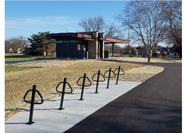
Olbrich Park Walter Street Parking Lot