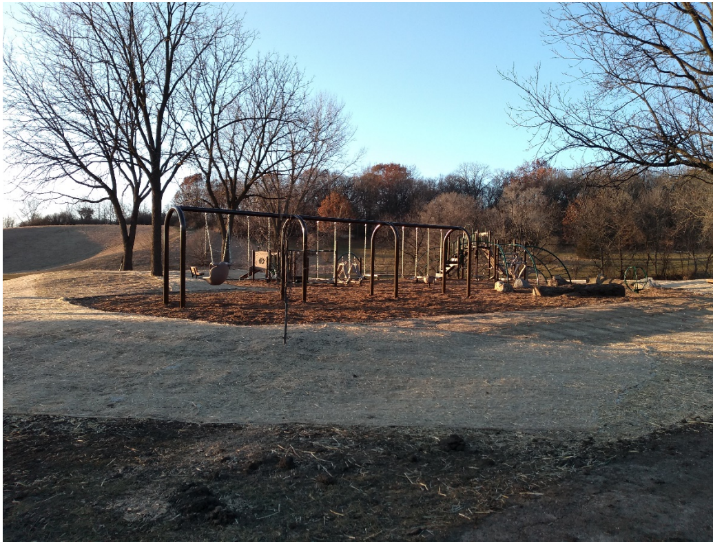
Hiestand Park Playground