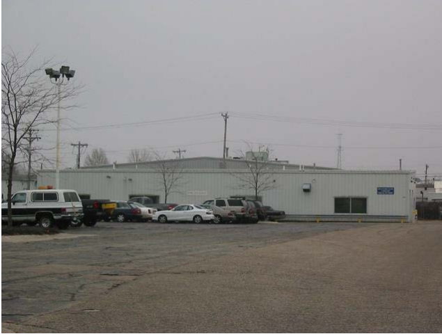
City Assessor's Office

Commercial building constructed in 1983.