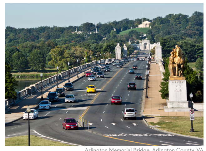
Arlington Memorial Bridge, Arlington County, VA

Program staff help developers select TDM strategies appropriate for each site and maintain a website<sup>8</sup> to assist developers and property owners in navigating the process. The website