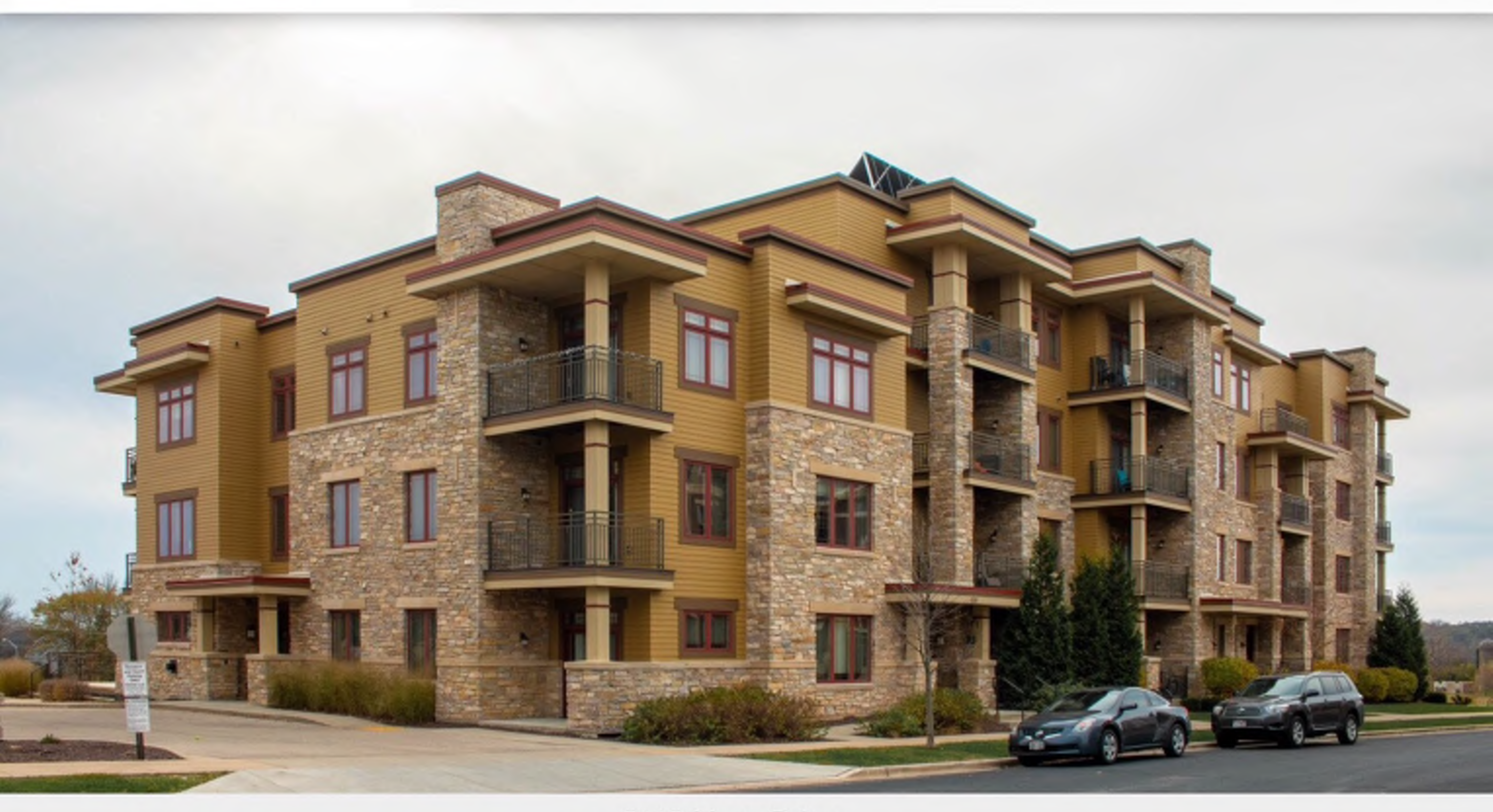
8119 Mayo Drive Madison, Wisconsin 53719