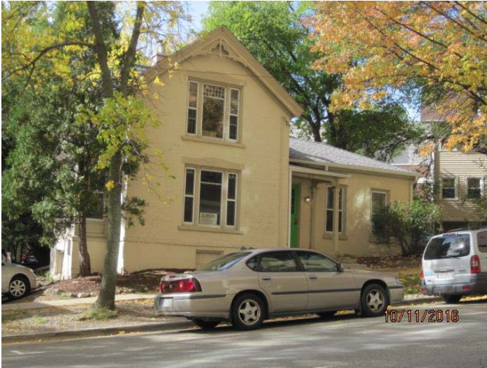
City Assessor's Office

Commercial building constructed in 1894, according to the City Assessor's Office records.