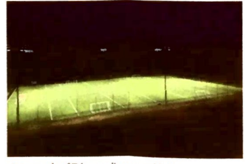
An example of Edgewood's proposed lighting system installed at Clemson Field

Lighting: The amended plan includes the incorporation of the latest LED lighting technology that will minimize glow, light spill and glare. This new technology, along with the height of the poles in our plans, will ensure that lighting from the limited number of night games will not go beyond our property. The plan meets and even exceeds the City lighting requirements.