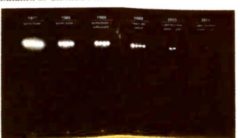
Edgewood's proposed lighting fixture is the one at the far right, as seen from 100 feet away