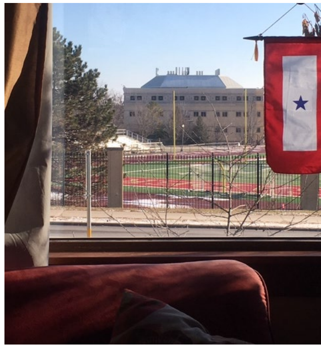
Living area views

Before 2015, there were about 4-6 lower level games in the fall (JV/freshman football) and 4-6 JV girls soccer games in the spring, and sometimes even less than that. These games were more of the nature of a practice with low attendance.