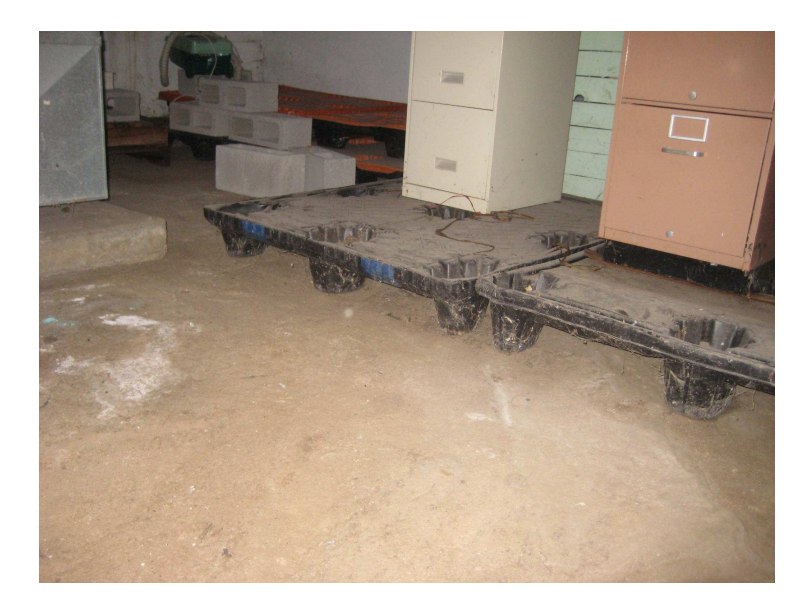
ELEVATED STORAGE DUE TO STANDING WATER

600 Chapman Street • Madison, WI 53711 • 608.630.9100 C 608.354.6288