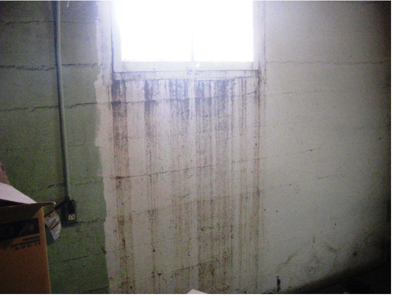
INTERIOR WINDOW CONDITION