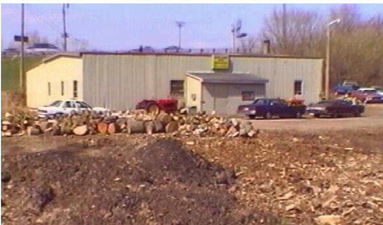
City Assessor's Office

Commercial building constructed in 1950.